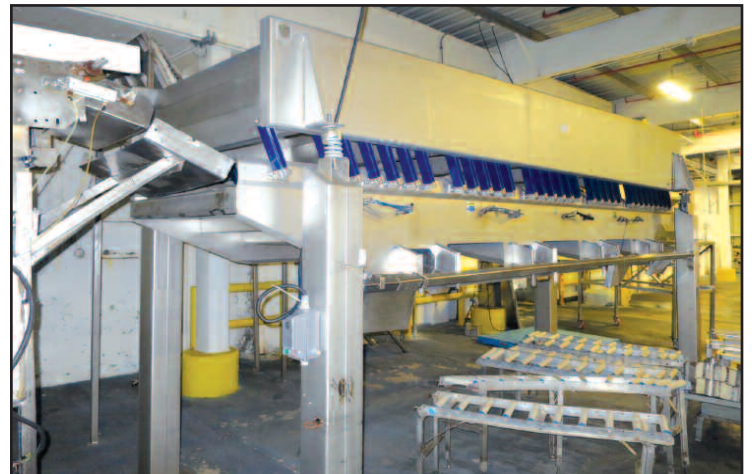
Key Iso Flo 36" x 18 Pan Shaker