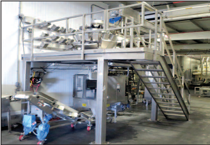
FF&S Bagger System with Ishida 16 head Weigher

Bean 3-Compartment S.S. Storage System w/ Cornell Pump, Overhead S.S. Feed Belt Conveyor, S.S. Off-Feed Belt Conveyor; Bin Dumper w/S.S. Wash Tank, 24" x 18' S.S. Flighted Belt Elevator; Jessee 30' Portable Incline Conveyor; (2) Tuthill 40hp Vacuum Pumps; 3' x 4' Vibratory Shaker; 24' x 20' Plastic Screen Conveyor; (2) Product Conveyors; Bin Shaker; 4-Bin Dump Station w/Hoppers and Off-Feed Conveyor; S.S. Bin Dumper with 24" x 8' Flighted Thermoplastic Belt Elevator; (2) Custom Frozen Cluster Breaker Elevators; (2) Video Jet 1510 Inkjet Printers; (4) Key Dogbone Style Shakers; (2) USM Onion Peelers; Kerian Size Grader; (2) Cluster Busters; S.S. Flotation Tank; Dorfa Slicer; (2) Iso-Flo 3' x 6' Shakers