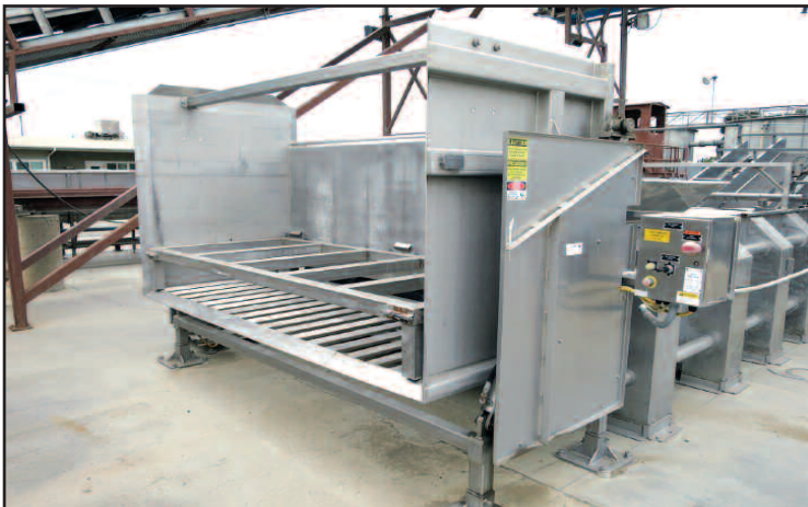
Heizen Double Bin Dumper