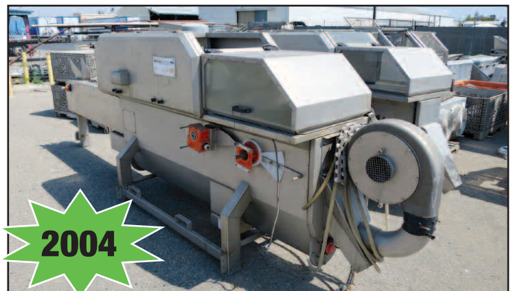
Backus Sormac bv Onion Slicers