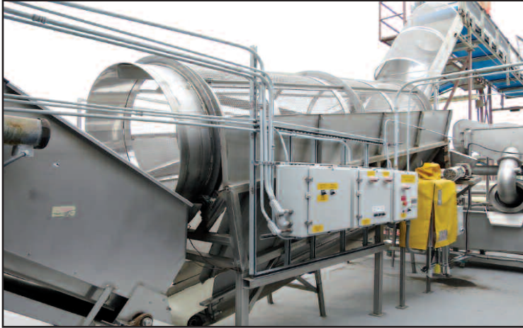
Spinach Line Cleaning Reel

Cornell 20hp Food Pump; (2) Olney 4' S.S. Flotation Washers w/Steel Frames; (4) Cornell 15-25hp, 6" Product Pumps; 8' x 16' S.S. Wash Tank with 60", 3-Lane Incline Chain Conveyor & Sieve