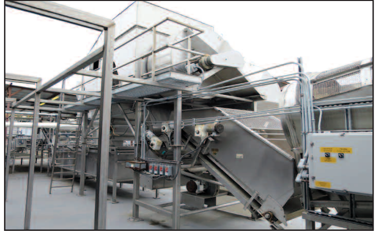
Spinach Line Super Vac System