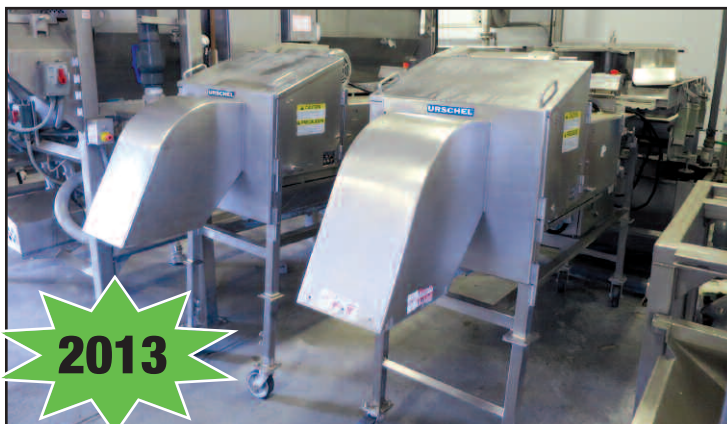
Urschel Model M6 Dicers

(2) (2013) Urschel Mod. M6 Dicers; (4) Urschel VSC Translicers; (2004) FAM Mod. ILL-30 Dicer. S/N 6138; (2) Urschel Mod. H, Dicers w/Change Parts. S/Ns 757 & 385