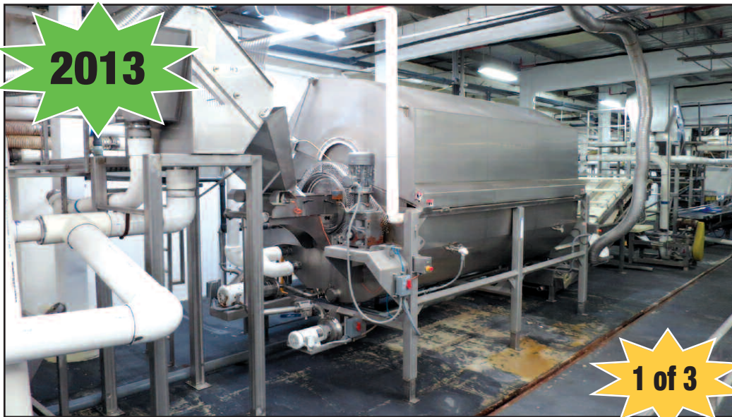
Lyco 8600, 6' Dia. X 12' Vapor Flow Blancher

(3) (2013) Lyco Mod. 8600 Vapor Flow Steam Blanchers, 6' Dia. x 12' w/Flume to Blancher, Flume Off-Feed from Blancher. S/N RBD-1113-72344 (Spinach/Pepper); RDB-0113-70084 & -70086