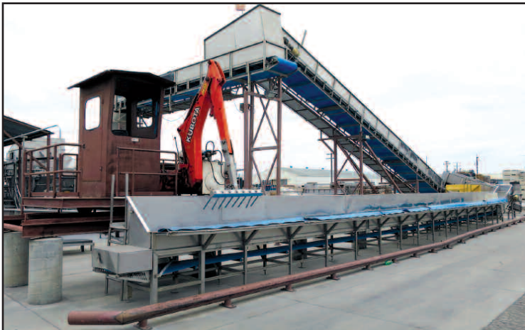
Kubota M59 Unloading Rake