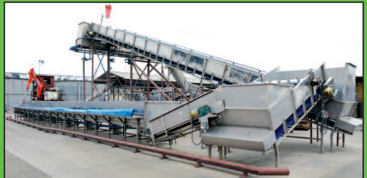
Kubota M59 Unloading Rake

650 Buena Vista Avenue, Oxnard, CA 93030