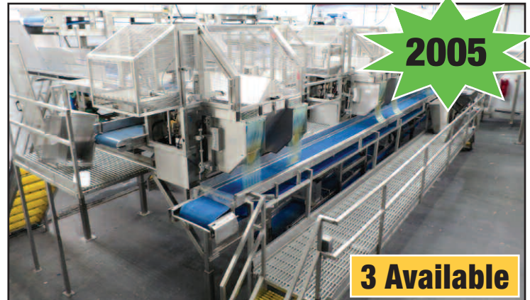
AEM DeCora K700-44-4 Decorating Lines