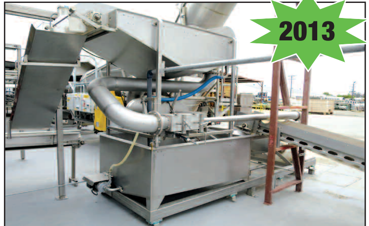
SFW/Cornell 30hp Water Knife