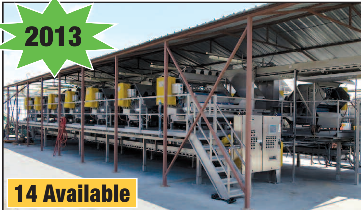
Dofra PD6000 Pepper Coring Machine

(3) (2005) AEM Decora Mod. K700-44-4, Cauliflower & Broccoli Decorating Machines w/Take Away Conveyors & Structure. S/Ns 738-1004-E210, 739-1004-E210, 737-1004-E210