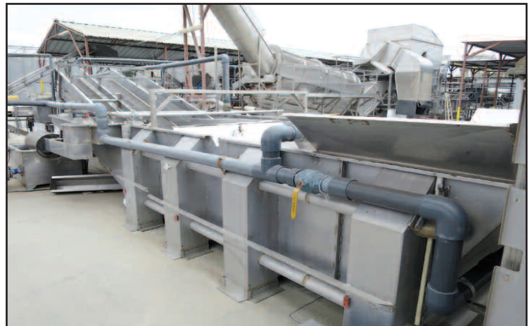
Garrouette Wash Tank on Pepper Line