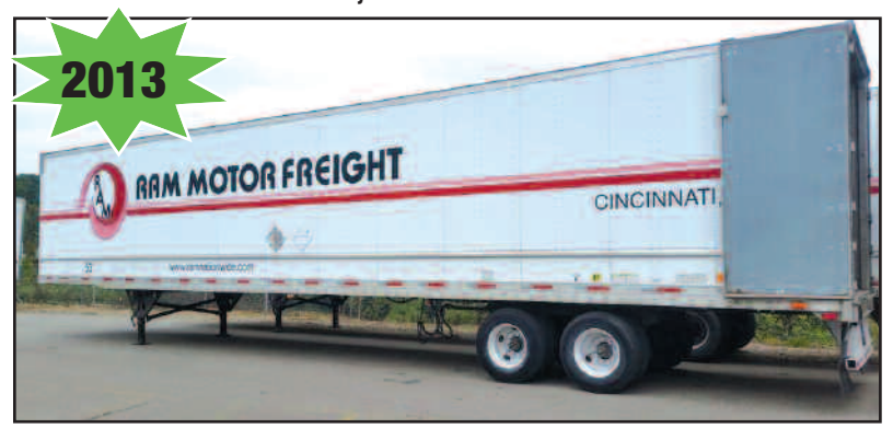
Utility 53' x 102" Van Trailer