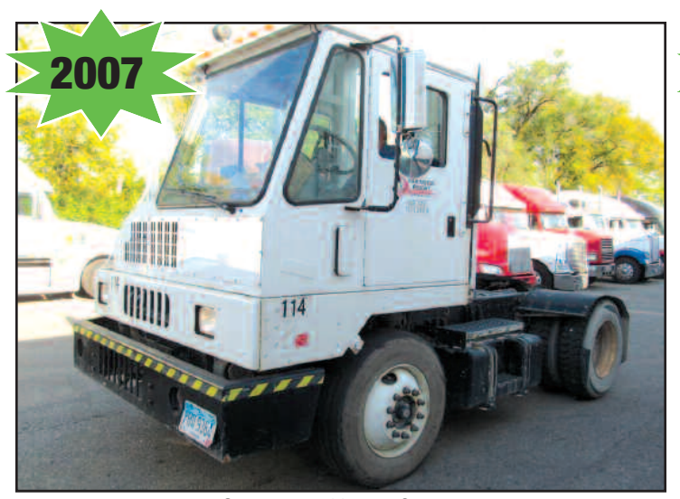
Ottawa Mod. 30, Yard Spotter