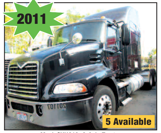
Mack CXU613, 3-Axle Tractor