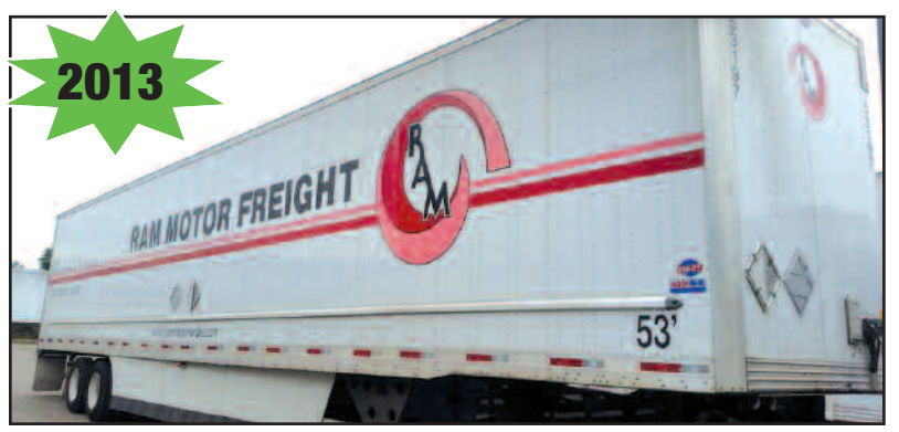
Utility 53' x 102" Van Trailer

(10) (1996) Utility Mod. VS2DC, 48' Dry Van Trailers, Aluminum w/ Spring Over Air Suspension & Sliders; 48' x 102"