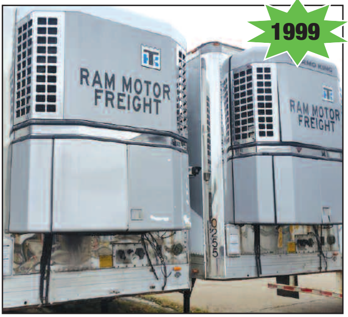
View of (2) Utility 48' Refrigerated Van Trailers

Above Quantities and Descriptions Are Just a Guide. More Trailers To Be Added – Please Check the Auction Catalog at www.tauberaronsinc.com