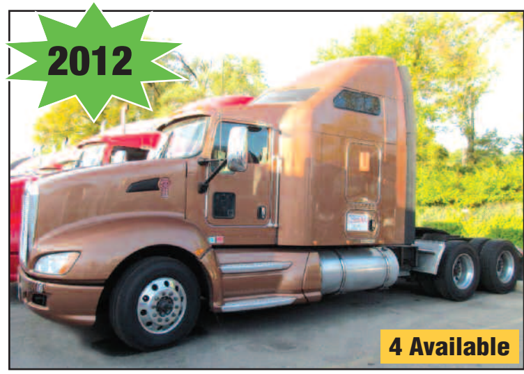
Kenworth T660 3-Axle Tractor