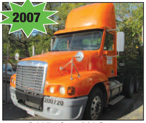
Freightliner Century 3-Axle Tractor