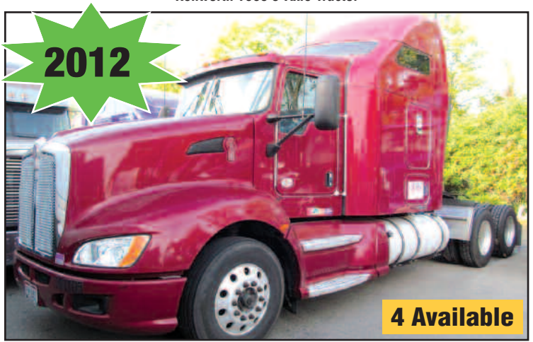
Kenworth T660, 3-Axle Tractor