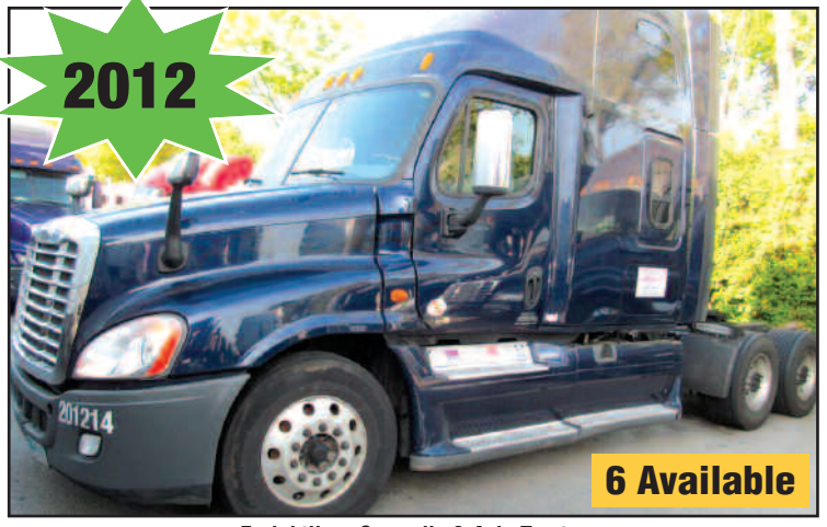
Freightliner Cascadia 3-Axle Tractor