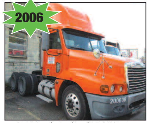
Freightliner Century Class SII, 3-Axle Tractor