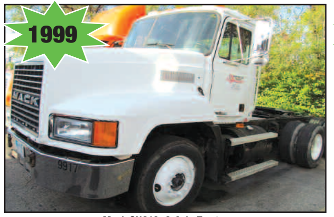
Mack CH613, 3-Axle Tractor