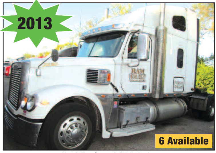
Freightliner Coronado 3-Axle Tractor