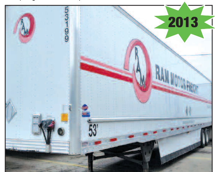
Utility 53' x 102" Van Trailer