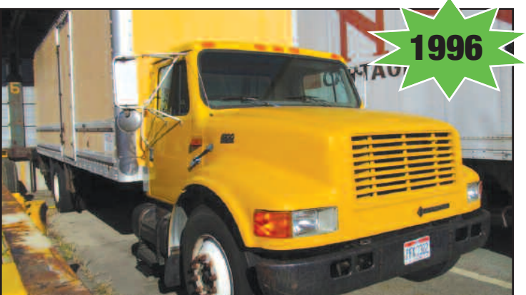
International 4900 Box Truck

(2005) Ottawa mod. 30 Yard Spotter, 2-Axle Automatic Transmission w/ 5.9 Cummins Diesel Engine w/ Rockwell Rear End 531 Gear Ratio. HRs: 36,226; Lic# PHB2808; S/N 309477. Unit# 113