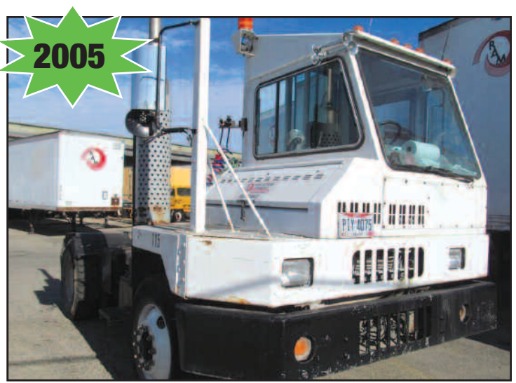
Ottawa Mod. 30, Yard Spotter