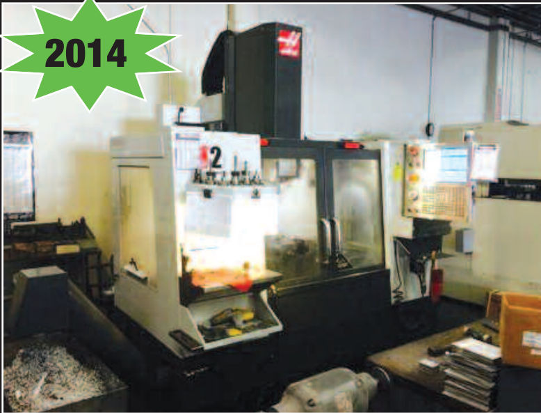
Haas VF2 Vert CNC Machine Center