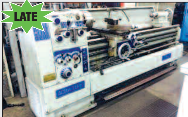
Acra-Turn 1767 Engine Lathe

Acra-Turn Mod. 1767, 17" x 67" Engine Lathe w/ Sargun DROs, 3 Jaw Chuck, KDK Tool Holder, Tail Stock. S/N CH96866