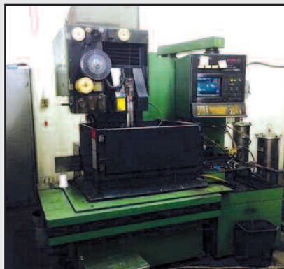
Sodick A500 Wire Cut EDM

Fine Sodick Mod. K1C EDM Machine (1992) Sodick Mod. A350L Wire Cut EDM Machine w/ Fine Sodick Mark 21 High Quality EDW. S/N 499