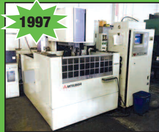
Mitsubishi FX20 Wire Cut EDM Machine