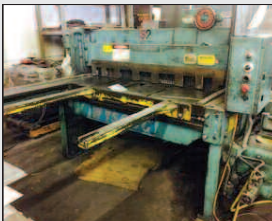
Wysong 1252 Power Squaring Shear

Wysong Mod. 1252, 52" x 12 Ga. Power Squaring Shear w/ Front Extensions, Squaring Arm, FOBG. S/N P13-1183