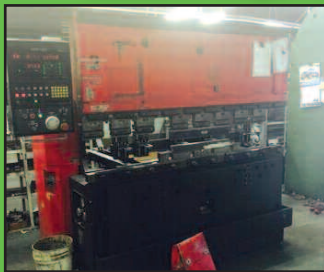
Amada FBD-5020 CNC Press Brake

INSPECTION: Tuesday & Wednesday, September 15th & 16th, 9:00am to 4:00pm PDT & Morning of the Sale