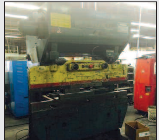
Wysong 2056 Power Press Brake

Wysong Mod. 2056, 6' x 55-Ton Power Press Brake, 2 1/2" Stroke, 3" Adjustment. S/N HPB22-108