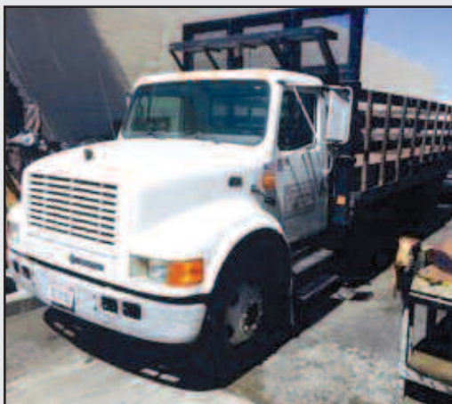
International Stake Bed Pick-Up Truck

International 4700, T444E, 24' Stake Bed Pick-Up Truck Chevy 3500, 12' Stake Bed Pick-Up Truck