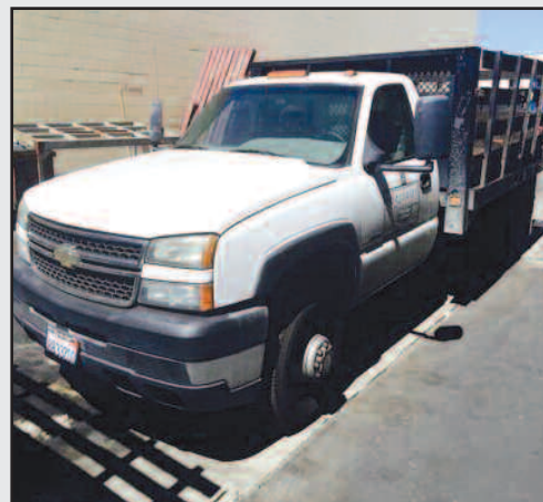
Chevy Stake Bed Pick-Up Truck

J&L Mod. TC-14, 14" Optical Comparator w/ Quadra-Check 2000 DRO; Goko Seiki Hardness Tester; Mitutoyo Height Gauges; 4' x 6' Lip Type Granite Surface Plate; Mitutoyo Height Master; Calipers; Gauges, etc.