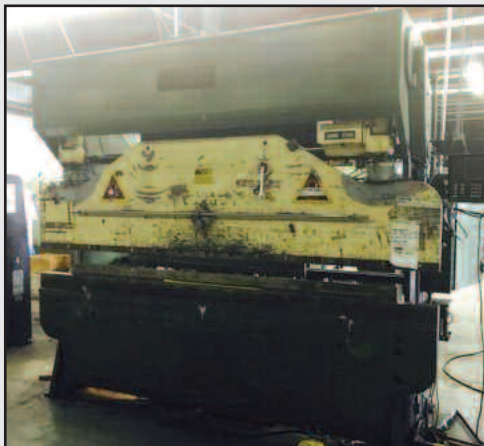
Di-Acro 75-10 Power Press Brake

DiAcro Mod. 75-10, 10' x 75-Ton Hydro-Power Press Brake w/ DRC Pendant Controls, ROBG. S/N 6751277109