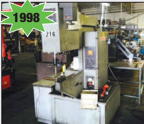
Haeger 824-1H Insertion Press

(1998) Haeger Mod. 824-1H, 8-Ton Insertion Press. S/N 08H00560