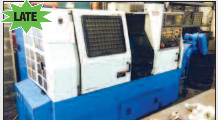
Wintec TC-15 CNC Turning Center

(1993) Wintec Mod. TC-15 CNC Turning Center w/ Fanuc OT CNC Controls, Tail Stock, Tool Changer, 3 Jaw Chuck, Chip Conveyor. S/N W10413