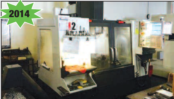
**2014** Haas VF2 Vert CNC Machine Center

(2014) Haas Mod. VF2, Vertical CNC Machine Center w/ Haas CNC Controls, Chip Conveyor, 20 Position ATC. S/N 1115013