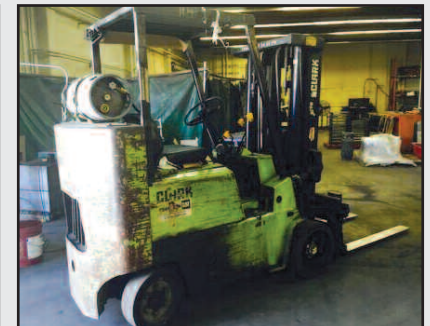
Clark 4000lb LPG Forklift