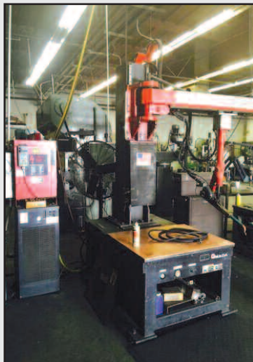
Amada Radial Arm Welder

Acme Mod. 2-24-30, 30 KVA Spot Welder, 24" x 6" Gap. S/N 14771