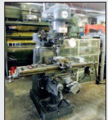
Lagun FTV-2 Vertical Mill

Lagun Mod. FTV-2, Var. Spd. Vertical Mill with Sony Millman DROs, 10" x 50" PF Table