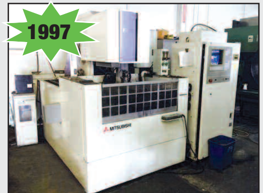
Mitsubishi FX20 Wire Cut EDM Machine

(1992) Sodick Mod. A500 Wire Cut CNC EDM Machine w/ Fine Sodick Mark 21 High Quality EDW. S/N WH676 (1997) Mitsubishi Mod. FX20 Wire Cut CNC EDM Machine with Mitsubishi CNC Controls, Unit Cooler, Filtration Unit. S/N 07E 20231