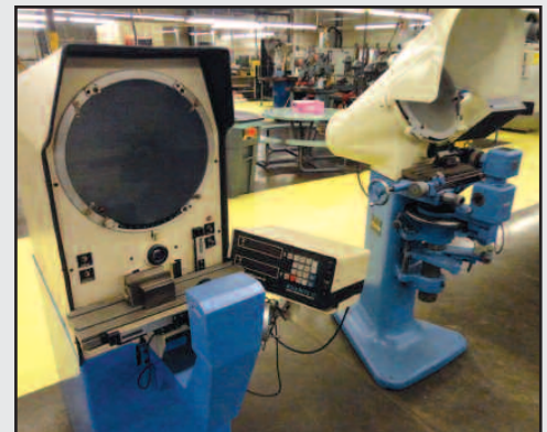
Micro VU & J&L Optical Comparators

For more Information, visit our website at: www.tauberaronsinc.com