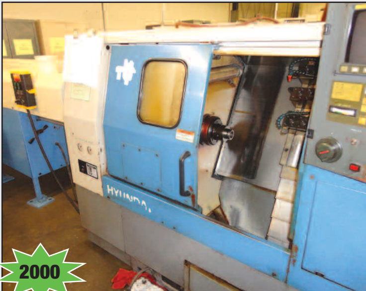
Hyundai HIT400G Turning Center