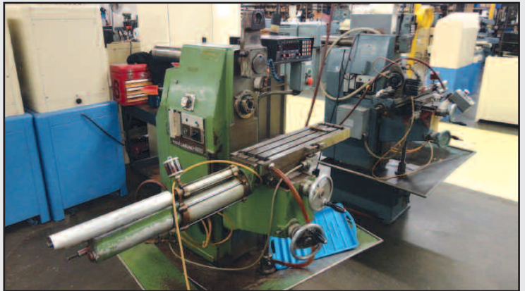
Lagun/Haas Horizontal Mills