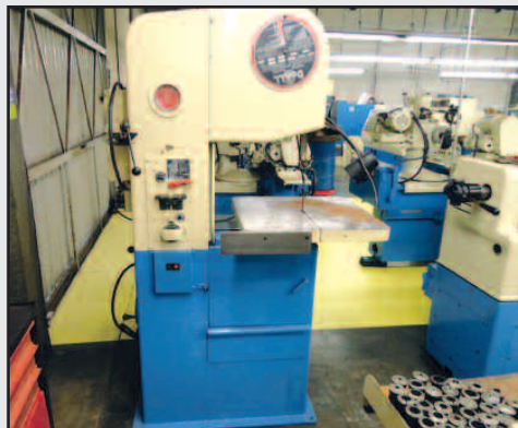
DoAll 16" Band Saw