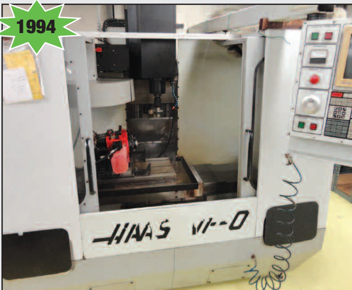
Haas Mod. VFO, 4-Axis Vertical Machine Center