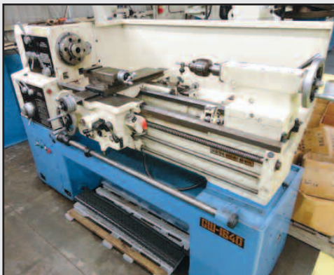
Goodway 16"x40" Engine Lathe