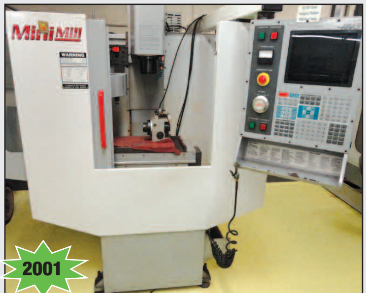
Haas Mod. Mini Mill, 4-Axis Vertical Machine Center

INSPECTION: Tuesday, March 3rd, 9 a.m. to 4 p.m. and Morning of the Sale