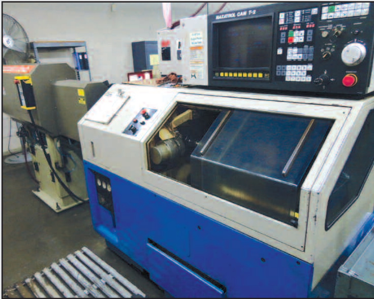
Mazak QT8 Turning Center

(2) Mazak Universal QT10 CNC Turning Centers, Mazatrol T-1 Controls, Turret, Tailstock, LNS Hydro Bar Feed. S/N 60442, 57205