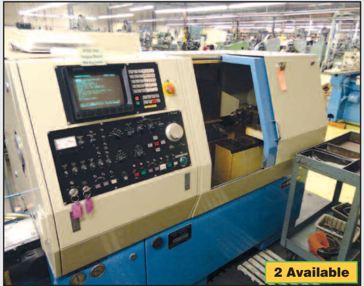
Kitamura TX80 Turning Centers