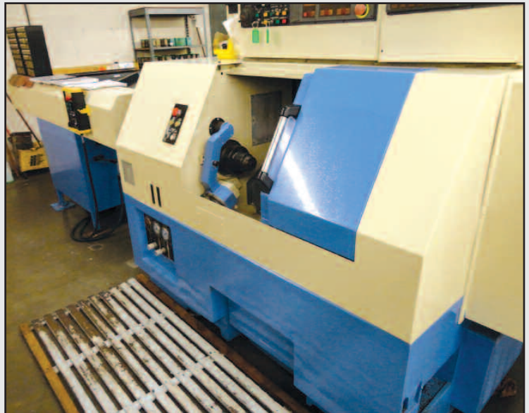
Leadwell LTG 10AD Turning Center