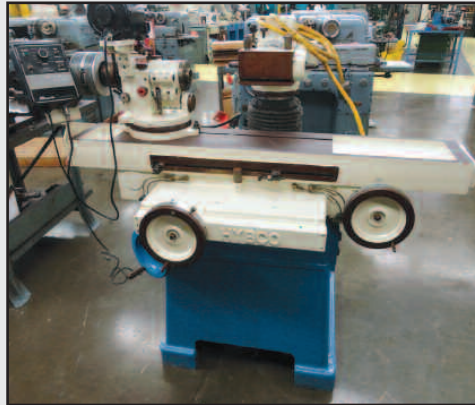
Hybco Form Relief Grinder