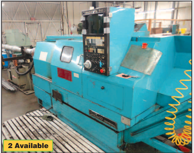
Mazak QT10 Turning Centers