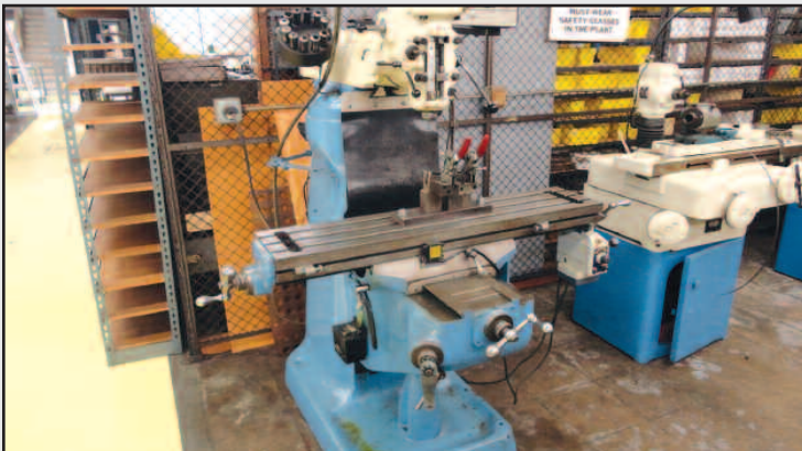
Bridgeport 1 1/2hp Vertical Mill