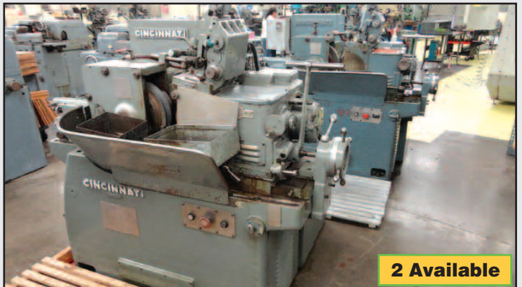
Cincinnati No. 1-OM Centerless Grinders

For more Information, visit our website at: www.tauberaronsinc.com