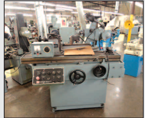
Winslow FR200 Form Relief Grinder