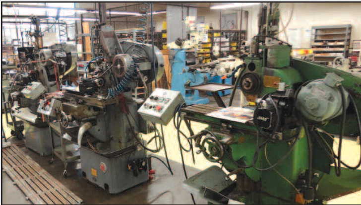
Nichols/Haas Horizontal Mills

(2) Cincinnati Mod. 1-OM Centerless Grinders. S/N 1M4H8SP-1 & 1M4H5R-14