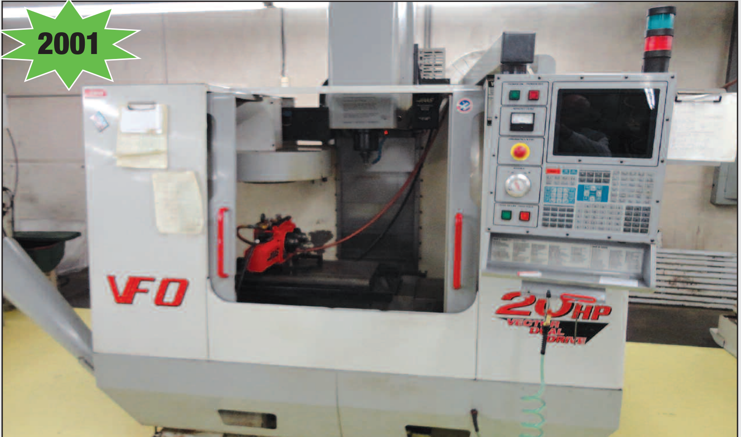
Haas Mod. VFO, 4-Axis Vertical Machine Center