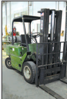
Clark 5000lb. LPG Forklift