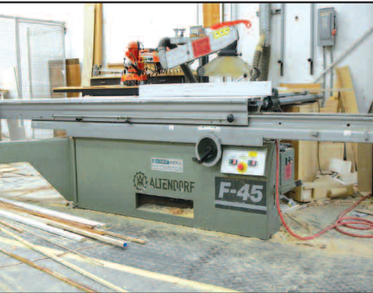
One of (3) Altendorf Mod. F-45, Sliding Bed Table Saws