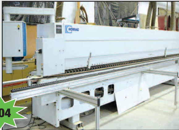
Homag Optimat KAL Single-Sided CNC Edge Bander