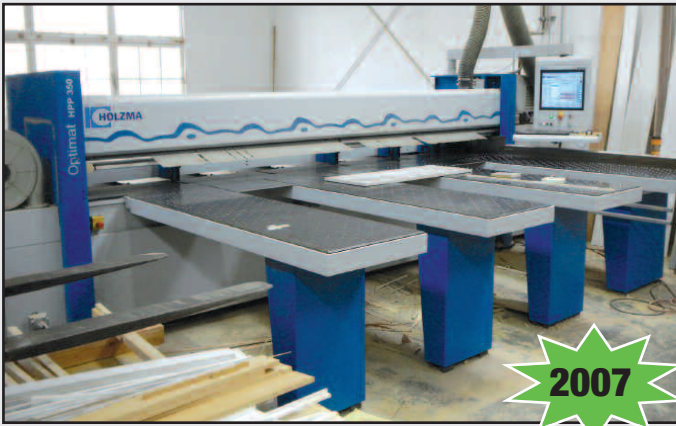
Holzma Optimat HPP 350/43/43, 12' Horizontal CNC Panel Saw