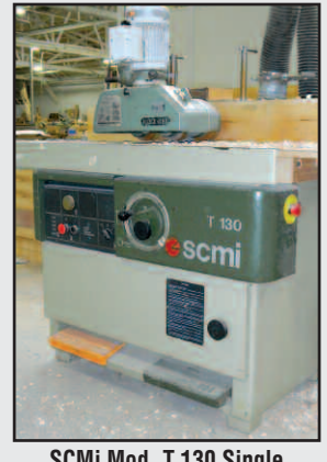
SCMi Mod. T 130 Single Spindle Shaper