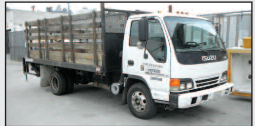
Isuzu NPR-HD Stake Bed Pick Up Truck