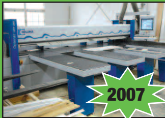
Holzma Optimat HPP 350/43/43, 12' Horizontal CNC Panel Saw

9:00 a.m. to 4:00 p.m. and Morning of the Sale