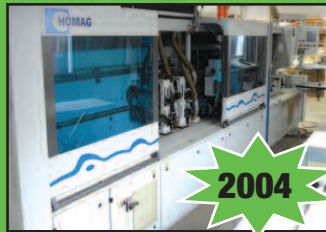
Homag Optimat KAL Single-Sided CNC Edge Bander