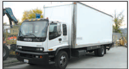
Isuzu FTR Box Truck w/ 24' Van w/ Hyd. Lift Gate