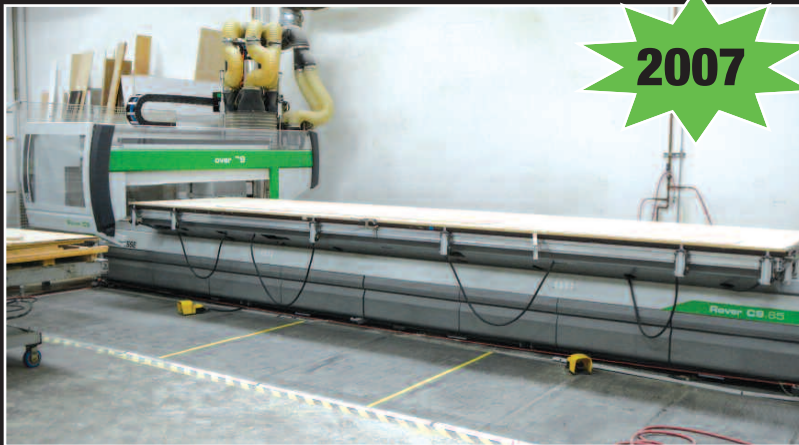
Biesse Rover 5-Axis Vertical CNC Router