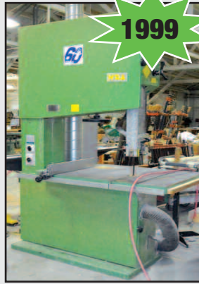
N'Ra Mod. 900, 36" Vertical Band Saw