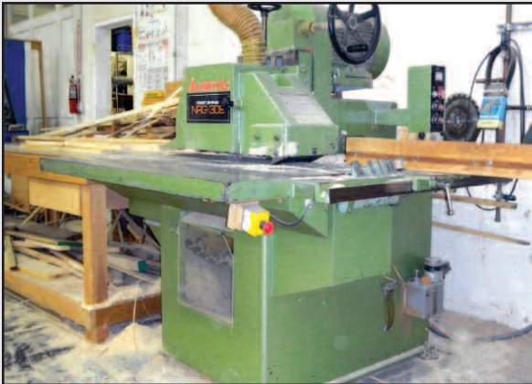
Amitec Mod. NRG-30S, Straight Line Rip Saw