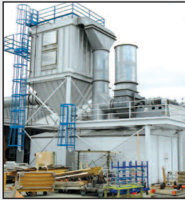
Donaldson/Torit 100hp Cyclone Dust Collection System