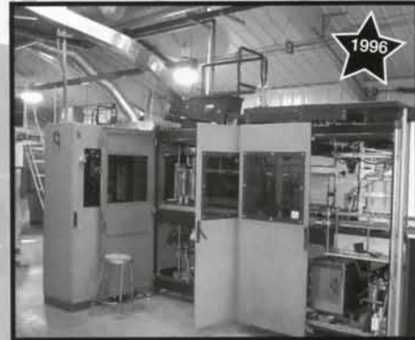
Dynaplast DB30/125 Blow Molder

DAY 2 BLOW MOLDING 513 S. Valley Way, Palmer AK