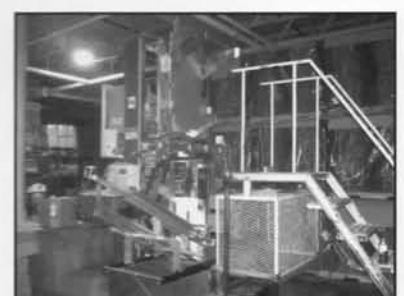
SWF Blissmatic 1DSAK Box Former

Visit our Website: www.tauberaronsinc.com