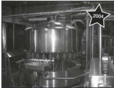
Franz 1/2 Gal. 20-Head Rotary Filler