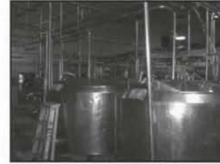
500 Gal. SS Process Tanks