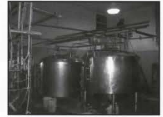
C.B. 500 Gal. Jacketed Tanks