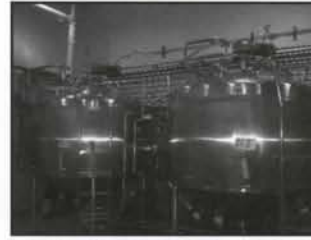
(2) Mueller PCPC, 1000 Gal. Dbl. Jacketed Process Tanks

500 Gal. SS Batch/Mix Tank, Jacketed w/Top Mt. Agitator.