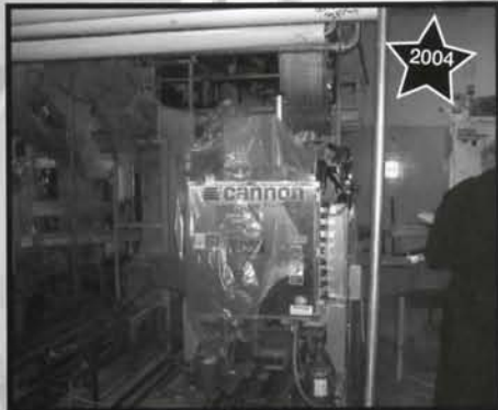
Cannon 1/3 Gal. Case Packer

DAY 1 DAIRY PROCESSING 814 W. Northern Lights Bl., Anchorage, AK