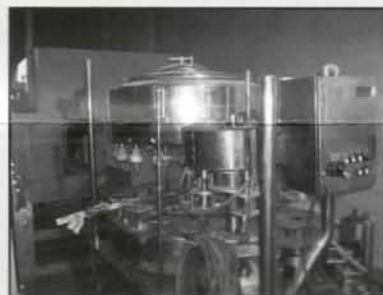
Federal 15-Head Rotary Filler

2004 Franz Mod. 288LSFCS, 28-Head Rotary Filler, 1/2 Gal. w/2-Head Pneu. Rotary Capper, Cap Feeder, Change Parts for 32mm Chug Bottle, Controls.