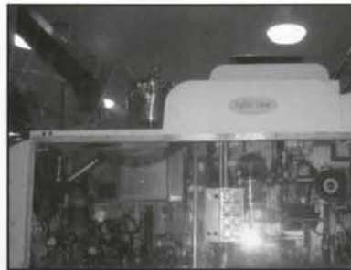
Excello Pure Pak 240 Filler