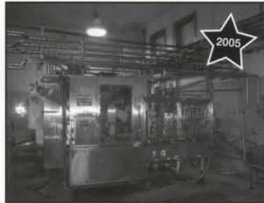
Pure Pak 5P-MILO Filler