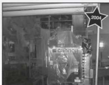
Cannon 1/3 Gal. Case Packer

Highlight Ind. Synergy 1 Semi-Auto. Pallet Stretch Wrapper; (2002) 3M Mod. 800A Case Sealer; Custom Made 1 Gal. Case Packer w/Pass-Thru Roller Conveyor.