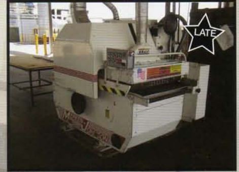
Mereen-Johnson 424 Gang Rip Saw

THURSDAY, SEPTEMBER 4, STARTING AT 10:30 AM