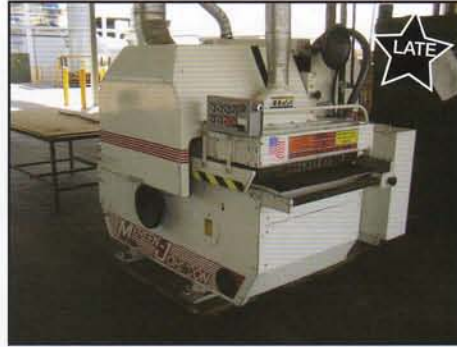
Mereen-Johnson 424 Gang Rip Saw