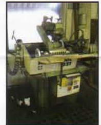
One of (2) Weinig Rondamat 931 Grinders

(1986) Weinig Rondamat 931, 9" Tool Grinder. S/N N/A