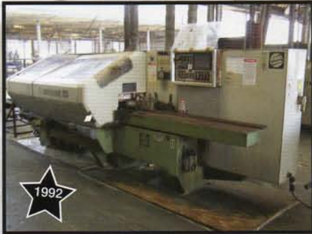
Weinig Unimat 23, 5-Spindle Moulder

From Downtown LA, Take the Pomona Fwy. (60) East Past The 605 To The S 7th St. Offramp, Right (North) on 7th To Valley Bl., Right On Valley To California Ave., Left On California To Nelson Ave., Left On Nelson to Sale Site!!!