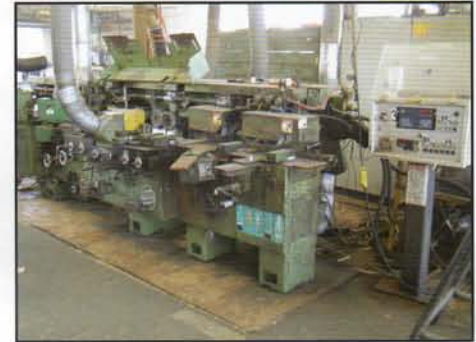
Weinig Unimat 22, 6-Spindle Moulder