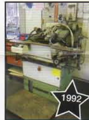
Weinig Rondamat 934 Grinder

(1992) Weinig Rondamat 934, 9" Tool Grinder. S/N 934-219