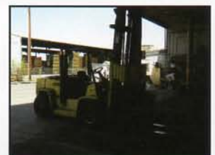
One of Assorted Forklifts

(2) Heavy Duty Dbl-End Grinders; DuraCraft DP-1617 Bench Type Drill Press; Assorted Port. Heavy Duty Sheds; Makita 10" Miter Saw; 12" Joints; DeWalt Radial Arm Saw; Black & Decker Cut-Off Saw; Wright Self-Dumping Hopper; Strapping Units; Hand Tools; Pneu. Tools.