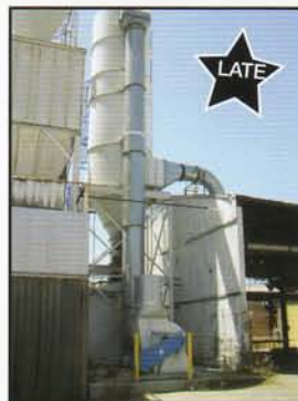
LMC 75hp Dust Collection System.