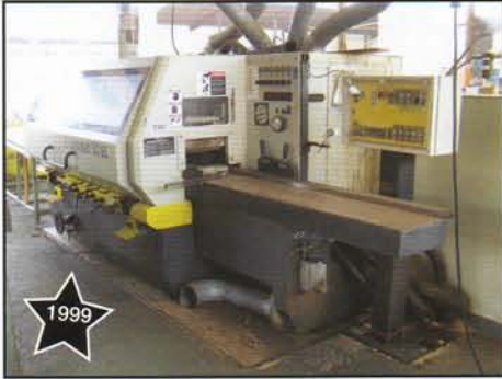
Weinig Unimat 30EL, 12"x5-Spindle Moulder

(1999) Weinig Unimat 30EL, 12"x5-Spindle Moulder. S/N 88379