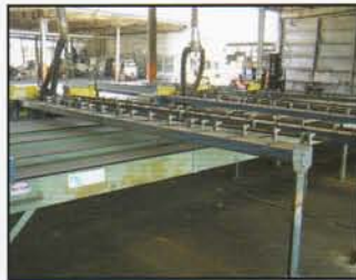
View of Chop Line

(6) Whirlwind 312 Under-Cut Saws w/MSL Conveyor Systems.