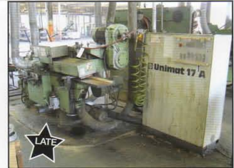
Weinig Unimat 17A, 5-Spindle Moulder