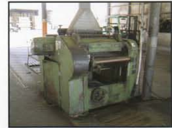
One of (4) Buss Mod. 55 Size 30x14 Planers

(4) Buss Mod. 55, Size 30x14 Planers w/Jointer Bars. S/N's 6532, 7401, 5923, 7020