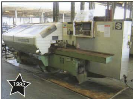
Weinig Unimat 23, 5-Spindle Moulder