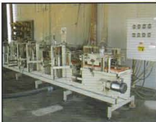
GME 10-Spindle Profile Sander