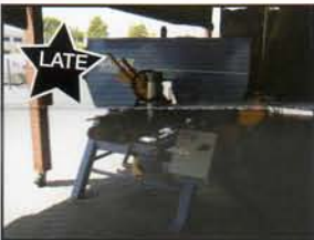
Baker Mod. A, 12" Horiz. Re-Saw

Baker Mod. A, 12" Horiz. Re-Saw w/ Lube System. S/N N/A