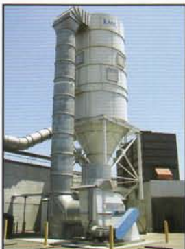
LMC 400hp Dust Collection System w/EcoGate Greenbox Master EcoGate Power Master.