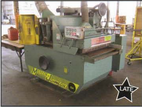
Mereen-Johnson 424 Gang Rip Saw