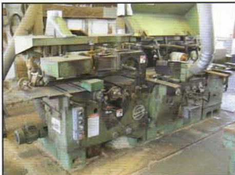
Weinig H30N, 12"x5-Spindle Moulder