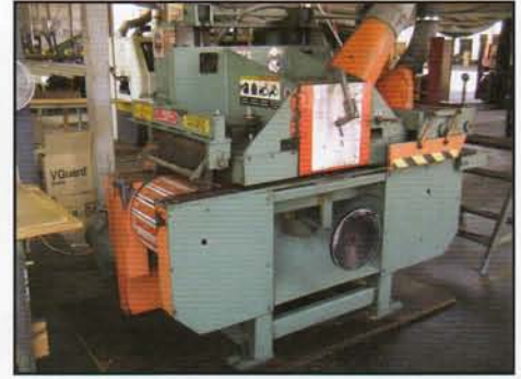
Mereen-Johnson 419 Gang Rip Saw

Mereen-Johnson Mod. 424-DL, 24" Gang Rip Saw w/ Pneu. Hold Downs, Sound Enclosure. S/N MJ-5966