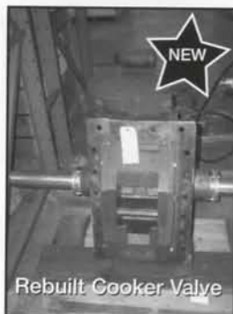
Rebuilt Cooker Valve