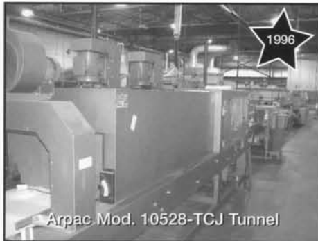
Arpac Mod. 10528-TCJ Tunnel