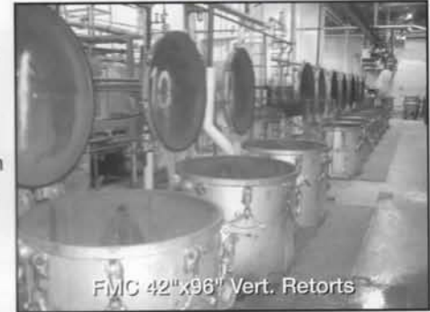
FMC 42"x96" Vert. Retorts

(10) FMC 42" Dia.x96" Deep, 3-Basket Vert. Retorts, 8 Lugs, Welded, Taylor Controls w/(2) Busse Round Basket Loaders & Unloaders w/Piston Jacks, (43) Busse False Bottom Round Baskets, Slatted Sides, Overhead Monorail System w/(5) Yale 1 1/2 Ton Hoists, Divider Sheets.