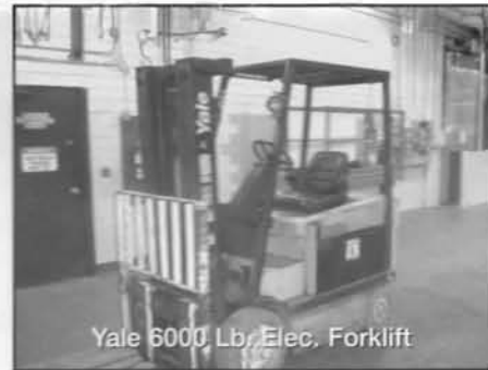
Yale 6000 Lb. Elec. Forklift