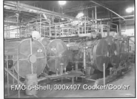
FMC 5-Shell, 300x407 Cooker/Cooler

(2000) FMC 4-Shell, 300x407 Rotary Pressure Cooker/Cooler; Logtec Controls; Cup In Feed. Shell 3647-286-61, 3901 Can Cap., Reverse; 2. Shell 3647-481-68, 3901 Can Cap., Standard; 3. Shell 3647-482-68, 3807 Can Cap., Reverse; 4. Shell 3642-247-74, 3807 Can Cap., Standard. (Rebuilt In 2000).