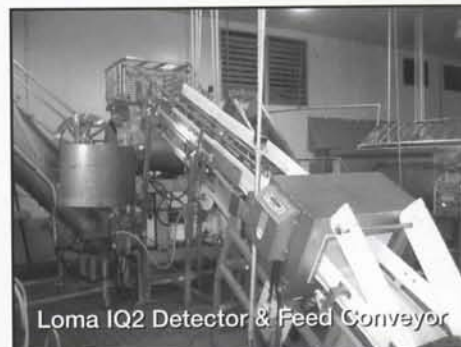
Loma IQ2 Detector & Feed Conveyor