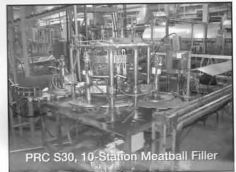
PRC S30, 10-Station Meatball Filler