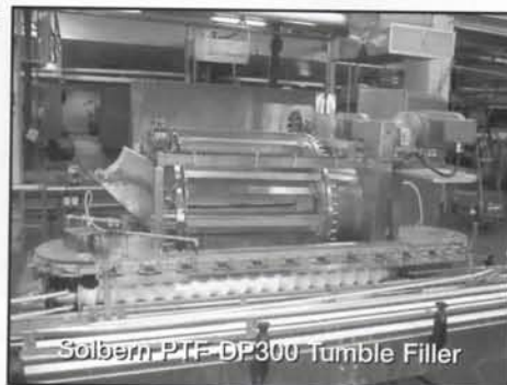
Solbern PTF-DP300 Tumble Filler

Solbern Mod. PTF-DP, 300 Tumble Filler; (1994) Zacmi Mod. W1410, 300x407, 24-Pocket Piston Filler, 11 \frac{1}{2} Gm. Standard Deviation. S/N 940340.