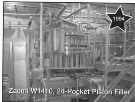
Zacmi W1410, 24-Pocket Piston Filler