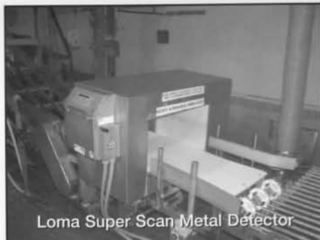
Loma Super Scan Metal Detector