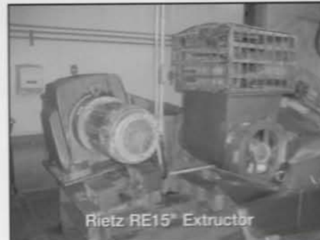
Rietz RE15" Extractor