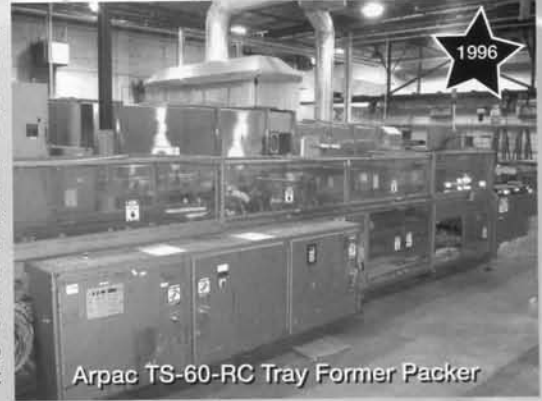
Arpac TS-60-RC Tray Former Packer

From BUF (Greater Buffalo International Airport) Take Hwy. 33 West To I-90 North To Hwy. 190 North Towards Niagara Falls, Exit Onto The Erie/Peace Bridge Into Canada. Take "QEW" North Approx. 10 Miles To Hwy. 20 East To Dorchester Rd. (1st Offramp) North On Dorchester Approx. 2 Miles To Cropp St., Right On Cropp To Pettit Ave., Left On Pettit To Sale Site!!! (Approx. 45 Minutes From BUF) From Toronto (Approx. 1½ hrs) Take The QEW South To Hwy. 20 East To Dorchester Rd. (1st Offramp) North On Dorchester Approx. 2 Miles To Cropp St., Right On Cropp To Pettit Ave., Left On Pettit To Sale Site!!!