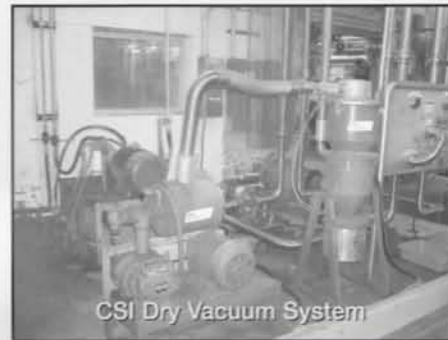
CSI Dry Vacuum System