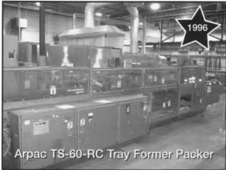
Arpac TS-60-RC Tray Former Packer