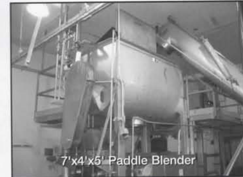
7'x4'x5' Paddle Blender

Loma Mod. Super Scan Micro 1SC, 22"Wx13"H, S.S. Metal Detector w/S.S. Feed Stand, w/24"x8' S.S. White Belt Incline Conveyor. S/N N/A