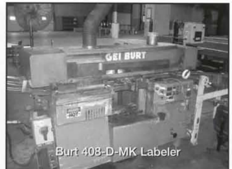
Burt 408-D-MK Labeler