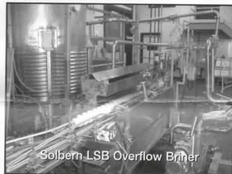
Solbern LSB Overflow Briner

(1996) Walker Mod. M, 8' Vacuum Twin-Shaft Jacketed Ribbon Blender, Dual-End Discharge, Twin 15hp G.H. Drives w/Feed Conveyor. S/N CP88