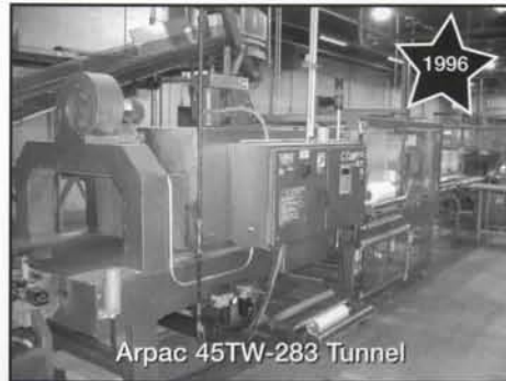
Arpac 45TW-283 Tunnel