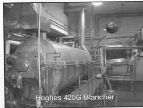
Hughes 425G Blancher

Hughes Type 425G, 15oz Blancher, 4' Dia.x16' Hot Water Rotary Reel w/4'x6' Dewatering Conveyor & 3" Centrifugal Pump.