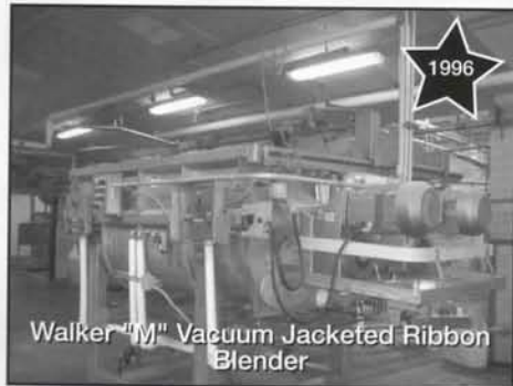
Walker "M" Vacuum Jacketed Ribbon Blender