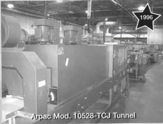
Arpac Mod. 10528-TCJ Tunnel

4825 Pettit Ave., Niagara Falls, Ontario, Canada