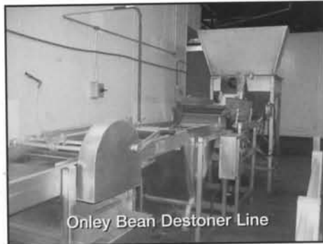
Onley Bean Destoner Line

Olney Mod. 24X56FS Destoner w/4x4 Bulk Feed Hopper, 8' Incline Screw Conveyor, Dewatering Shaker, Washer, Ripple Washer & Dewatering Shaker. S/N 04VS340.