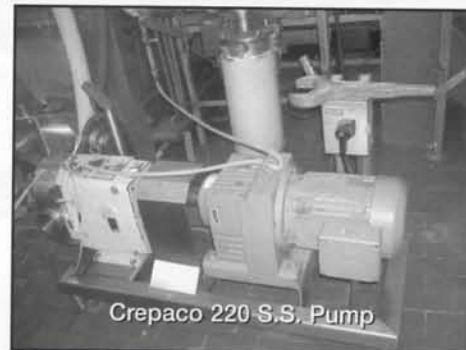
Crepaco 220 S.S. Pump