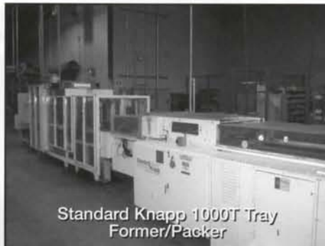
Standard Knapp 1000T Tray Former/Packer