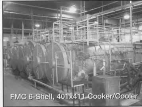
FMC 6-Shell, 401x411 Cooker/Cooler