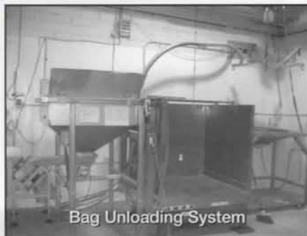
Bag Unloading System

Blue Giant Mod. FS5155X60, 400 Lb., 4' Tote Dumper S/N 0050487; 4' x 4' S.S. Vibratory Unloading Hopper; Loma Mod. SLFFS-CF, 6" Inline Metal Detector S/N LCM1FF; 2 Ton Elec. Hoists w/Monorail & Baglift & Scale System; CSI 7 1 / 4 hp Dry Ingredient Vacuum Pumping System w/Accumulator, Filter & Deposit Head; Bag Tote Bulk Unloader w/2 Ton Hoist.