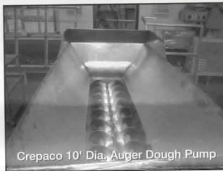
Crepaco 10' Dia. Auger Dough Pump

PRC Mod. S30, 10-Station, 15oz Meatball Filler, (3) Cutters.