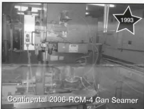
Continental 2006-RCM-4 Can Seamer