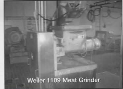
Weiler 1109 Meat Grinder