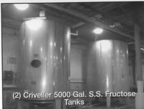
(2) Criveller 5000 Gal. S.S. Fructose Tanks