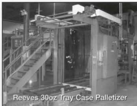
Reeves 30oz Tray Case Palletizer

(2) Continental 464 Single-High 15oz Can Depalletizers.