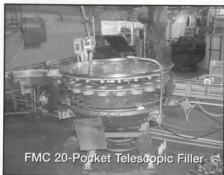
FMC 20-Pocket Telescopic Filler