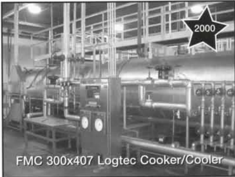
FMC 300x407 Logtec Cooker/Cooler