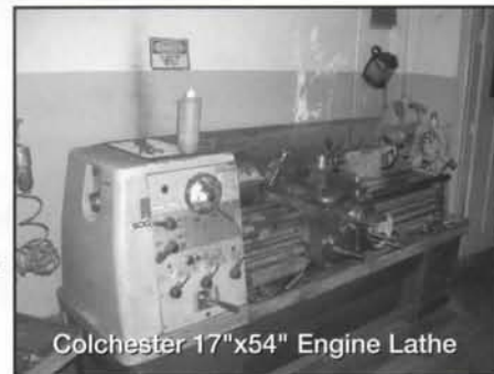
Colchester 17"x54" Engine Lathe

Ton Elec. Hoist; 6" Belt Sander; Drill Press; Hyd. Jacks & Power Tools; (2) Hyd. Presses.