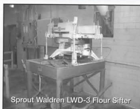
Sprout Waldren LWD-3 Flour Sifter