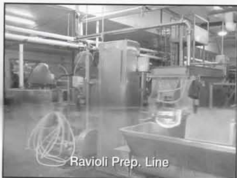
Ravioli Prep. Line