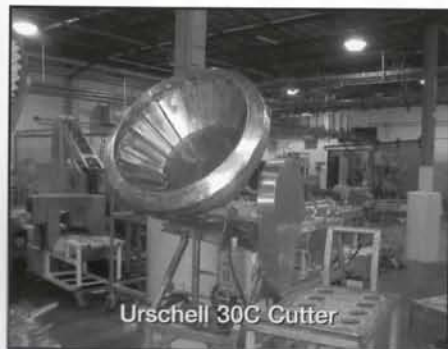
Urschell 30C Cutter