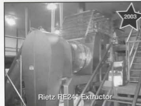
Rietz RE24" Extractor