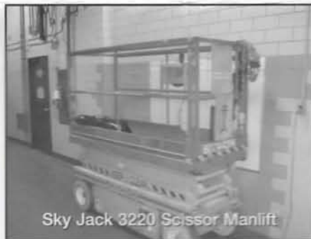
Sky Jack 3220 Scissor Manlift

(5) BT LS Series Walk Behind Elec. Lifts; (2) Battery Unloading Hoists.