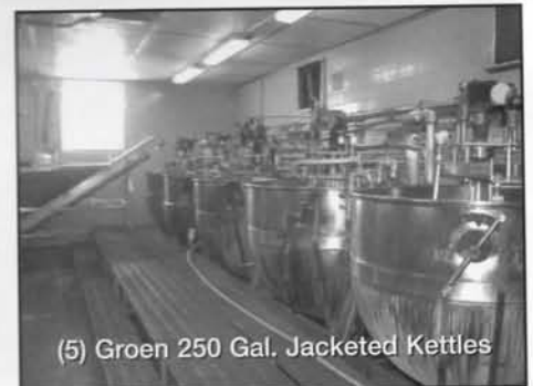
(5) Groen 250 Gal. Jacketed Kettles

(2) Criveller 5000 Gal. S.S. Full & 1/4 Fructose Tanks; 7000 Gal. Horiz. S.S. Holding Tank, 17'x6' Dia. (2) 2000 Gal. S.S. Mixing Tanks w/Lightnin' Jones 10 Mixer w/Tote Inverter; La-Heir 3500 Gal. S.S. Holding Tank, Dome Top, Manway. Groen 200 Gal. S.S. Kettle; (5) Groen 250 Gal. S.S. Jacketed Kettles, Single-Motion w/(2) 8' Auger Screw Feed Conveyors, (2) S.S. Tote Dumpers; 500 Gal. S.S. Holding Tanks; 200 Gal. S.S. Tank w/Lightnin' Mixer & S.S. Pump. 100 Gal. S.S. Tank w/Lightnin' Mixer; (4) 25 Gal. S.S. Mixing Tanks w/(2) Mixers; 5 Gal. Kettle w/Agitator; (3) Hydraserv Hyd. Pump Systems; (2) Waukesha Size 25 S.S. Pumps; Waukesha 4" S.S. Pump; 3" Diaphragm Pump.