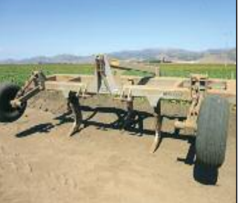
Wilcox MATB5-40 5-Shank Ripper

(2) Wiggins Mod. WD402D Forklifts Tovota Forklift Datsun 3000lb, Forklift 2003 Interstate 40 TLD Tilt Trailer, S/N 003528 2004 Peterbilt Mod. 330, 2,000 Gal. Water Truck 2011 Chevy Tahoe LTZ 2011 Chevy Silverado Super Cab 4WD Pickup 2005 Chevy Silverado Super Cab 4WD Pickup 2001 Chevy Service Truck, w/Welder & Compressor GMC Water Truck (4) Chevy Pickup Trucks Chevy Flatbed Truck (4) Harvesting Trailers (20) Pipe Trailers (3) Drip Tape Pull Trailers (13) Drip Tape Spool Trailers Flatbed Trailer (3) 10,000 Gal. Storage Tanks (3) 500-1000 Gal. Diesel Tanks (3000) Field Totes (24) Plastic Bins (100) Plastic Skid Pallets