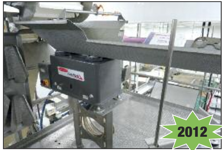
H&C Fast Back 260E-Gw Feeder