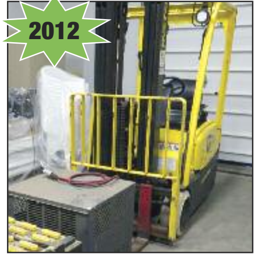
Hyster J30XNT Electric Forklift

2012 Hyster Mod. J30XNT, 3000 Lb. Elec. Forklift, w/Charger & Extra Battery, S/N K160N02681K Keenline 20"x 10' Port. Belt Conveyor (2) Modular Cold Rooms, w/Power Doors I.R. Mod. UP6-15CTAS-125W/D, 15 H.P. Rotary Screw Air Compressor, S/N CBV176110 (2) Larkin Mod. LZT0700M6D Chillers, S/Ns T11L02325, T11L02324 (2) Gas Vaults