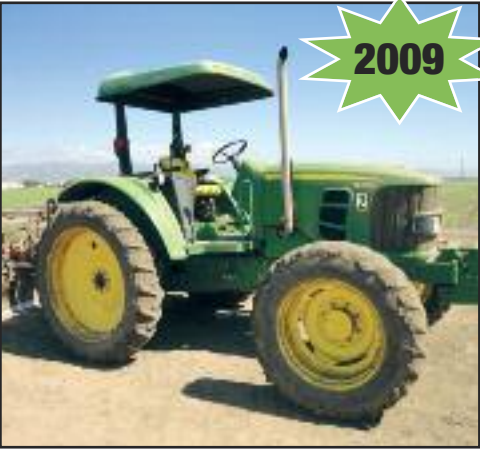
JD 6430 Tractor