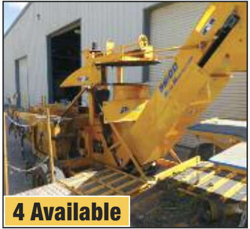
Oxbo BH100 Bean Harvester