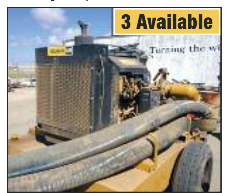
Caterpillar 308-5585 Booster Pump