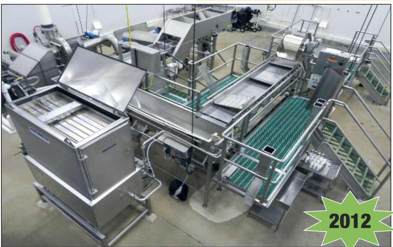
Overall View of Fresh Pack Processing Line