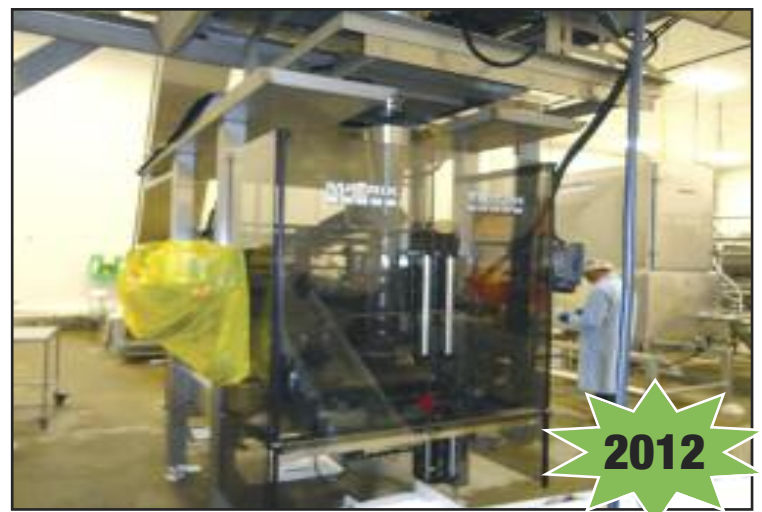
Matrix Triton Form-Fill-Bagger