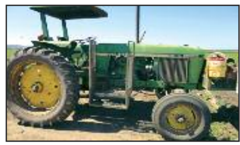
JD 2950 Tractor