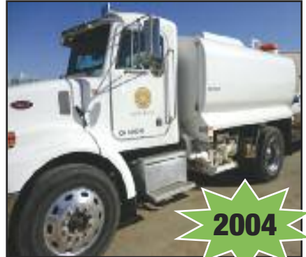
(2004) Pete 2,000 Gal. Water Truck