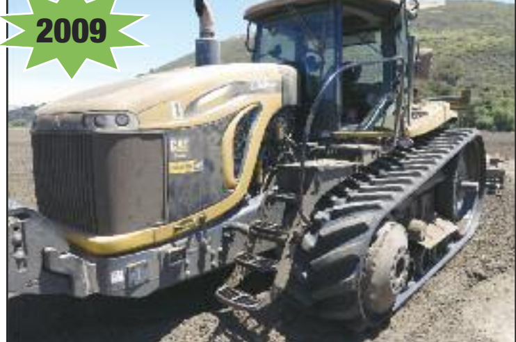
Challenger MT855C Crawler

2008 New Holland T6050 Tractor, S/N 29BD03289