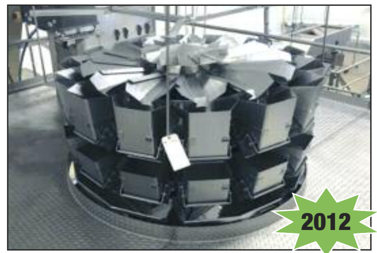
Ishida 14-Station Weigh Scale Feeder