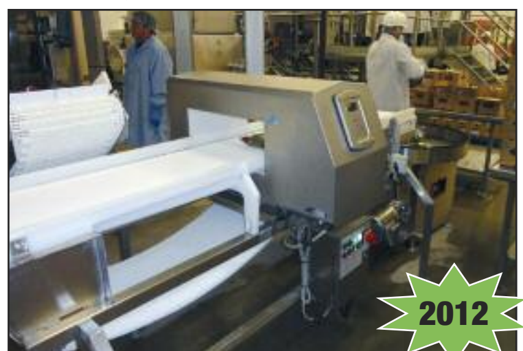
CEIA THS 21 Metal Detector