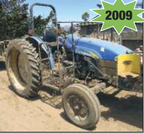
New Holland TT60A Tractor

New Holland T4.75 Tractor, (2) 1986 & 1984 J.D. 2750 MFWD Farm Tractor, S/Ns 5721642, 514783 JD Mod. 2950 Tractor, S/N LO2950T477594 Same 70C Explorer Tractor, w/Remote, S/N 411350 MF 231 Tractor, S/N 47045 (2) Case 65 MFWD Farm Tractors (4) MF 390T MFWD Tractors, S/Ns 833317, 035133, D12450, 34257 Fiat 80-75 Crawler Mudder Tractor, S/N 47556