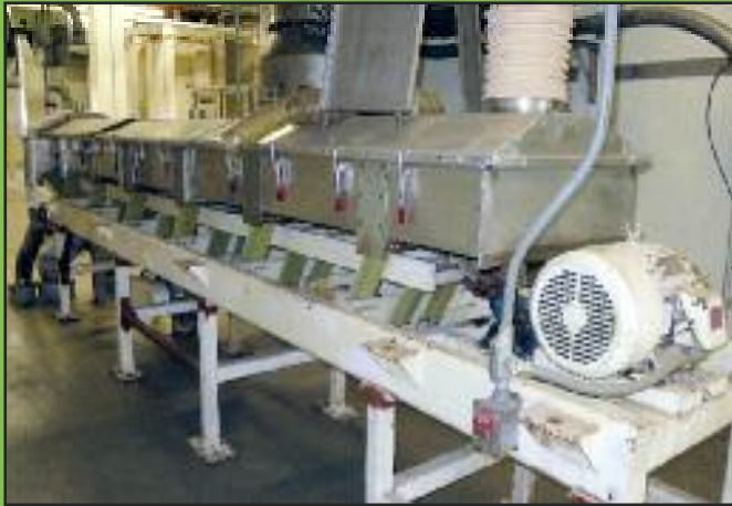
Cardwell S.S. Vibratory Conveyor, 32"x18'

Lot #1 Starts Closing: Tuesday, May 16, 10am PDT