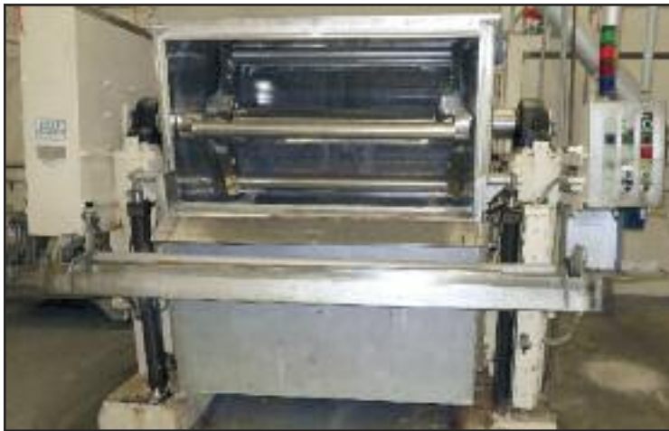
Baker Perkins 2000lb Roller Bar Dough Mixer