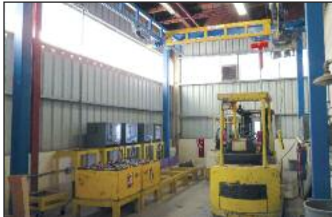
Gorbel Battery Hoist System