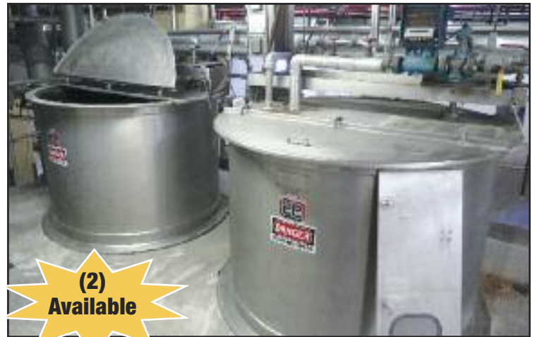
Lee S.S. Mixing Tanks

Assorted Diverter Valves, Blowers & Rotary Air Locks in Sifter Room; (3) S.S. Frame Enclosed Through Conveyor, 16" x 16', 18" x 24' Incline; Carrier Mod. BDL-N2-4150S, 24" x 18' S.S. Vibrating Conveyor, Suspended. S/N 15500; Waukesha Mod. 006 Sanitary Pump. S/N 280509-01; (Lot) Mass Flow Sensors & Assorted Valves; (2) S.S. Paddle Conveyors w/AB Controls; (2) S.S. Lump Breakers, 30hp w/AB Controls; (5) GRC Dust Collectors; (Lot) Micromotion Flow Meters, S.S. Valves, etc.