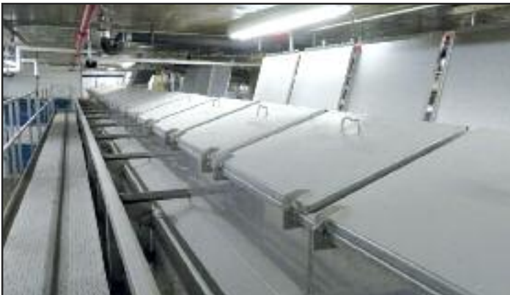
Shoulder Bros. 6'x60' 'Accumaveyor' Surge Bin