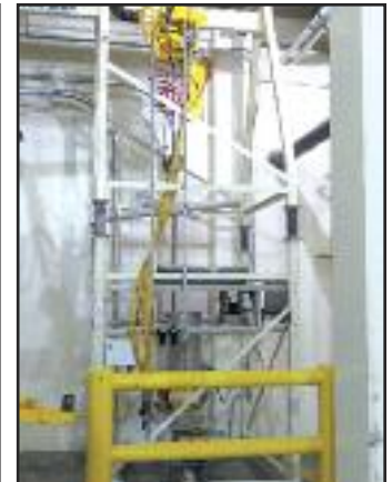
Super Sack Bag Dumper