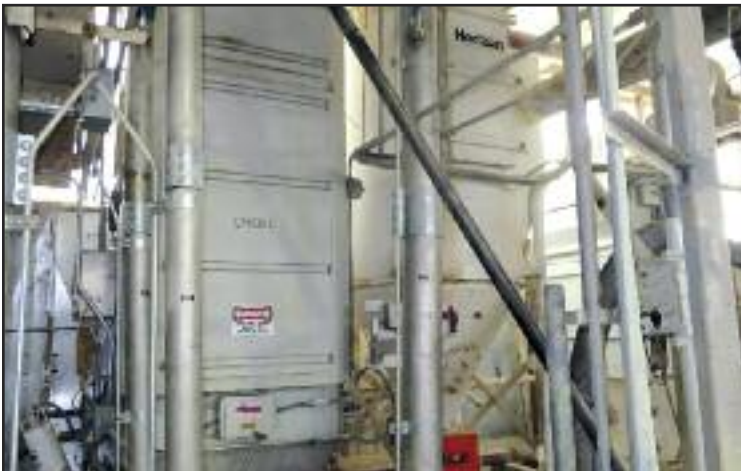
Unicel Dust Collector