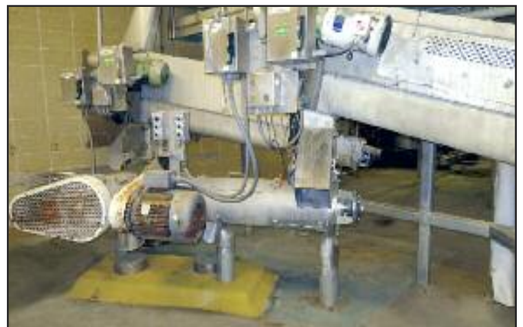
Dual Paddle Conveyor - Blender