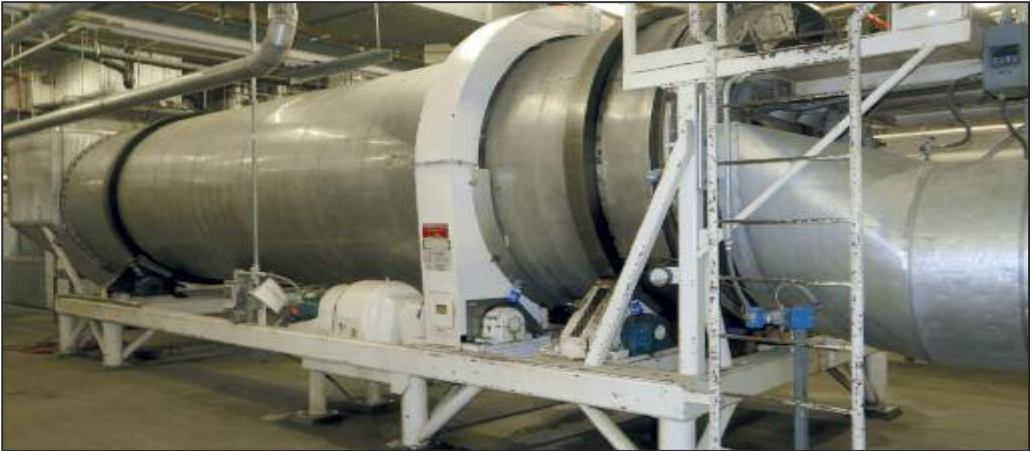
F.M.C. 7' Dia. x 30' Roto Louvre Dryer

Flex-Kleen Dust Collector on 4th & 3rd Floor Tanks; Sweco Mod. ZS40S88WC, Vibro-Energy Separator, Single Deck. S/N 566463-A0503; (Lot) Esco Magnetic Trap & (3) Rotary Air Locks ; DCE Unicell Dust Collector ; Great Western "HS" Sifter , Double 4' x 22"; Buhler Asperator. S/N 54860150; Mettler Toledo Mod. Lynx Digital Pallet Scale; A.B. McLaughlan S.S. Hydraulic Bin Dump. S/N 5220; S.S. Dump Bin w/Auger Discharge and Horizon Rotary Air Lock ; Lot (2) Coating Reels, 36" Dia. x 78"L w/Assorted Mass Flow Sensors, Valves, Flavor Tank, etc.; (4) 30" x 30' and 56' x 26' S.S., 8" x 20' Frame Suspended Belt Conveyor; (2) Key Iso-Flo Mod. 431168-1 S.S. Vibratory Shaker Conveyor, 6" Stroke, 24" x 12' & 78" x 78". S/N 02-87430 & 02-87429; ABM S.S. Frame 28" x 16' Incline Through Conveyor ; (2) Key Iso-Flo 30" x 7' x 5' S.S. Vibratory Shaker Conveyor , 6" Stroke; (3) (2002) K-Tron mod. S18028 Continuous Scales , 24" Bed. S/N MD2702012 & MD2802012; (2) Control and Metering Mod. DBW-01-350 , 12" Continuous Scale. S/Ns C2735, C2734, n/a; (2) S.S. Surge Bins; AAF Type W Roto-Clone , 10hp; (3) Horizon Twin Roto-Clones w/Twin City 20hp Blower ; (2) Sizing Systems w/ BF Gump Auger Feed Conveyor , Modern Process Break Roll, Bucket Elevator w/Platform; (2) S.S. Multi-Deck Vibratory Screens, 40" x 40"; (2) S.S. & Mild-Steel Bin Dumps; (Lot) Assorted Rotary Air Locks, Blowers