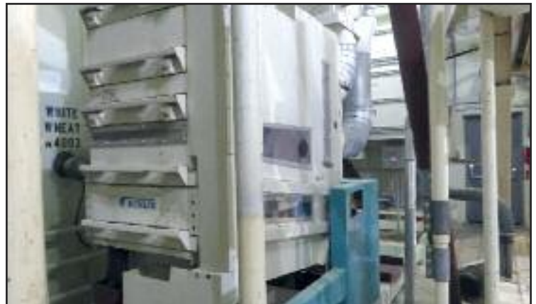
Buhler MTKB65/1200 Wheat Cleaner

Join our mailing list, email us at main@tauberaronsinc.com