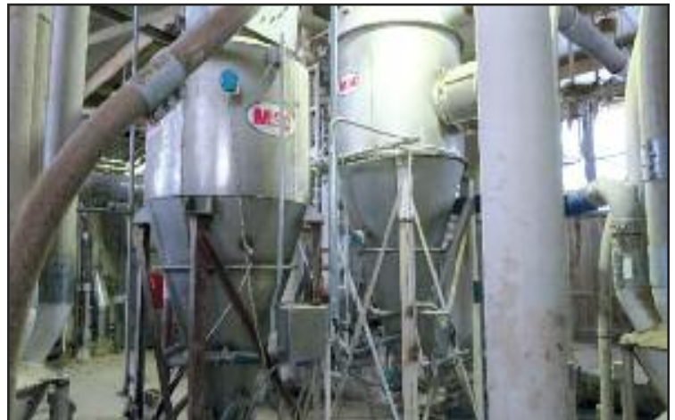
Mac Filter Dust Collector