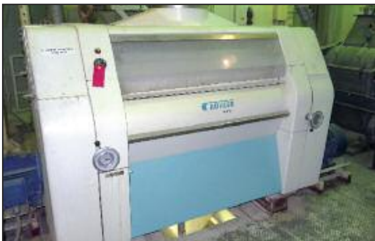
Buhler Wheat Scourer