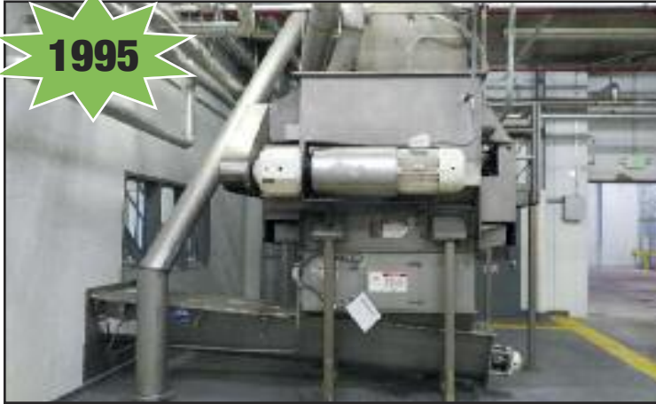
American Process System Mod. HS30 S.S. Dry Coating Mixer

(2006) Buhler Mod. MEAF and MZAH 12 Auger Blender System. S/N 156523/7