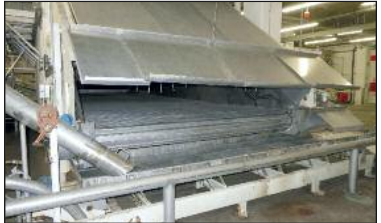
10' x 30' S.S. Finish Bin Holding Silo

Flake S.S. Chute w/Safeline Inline Metal Detector, Feeding to Packaging; Waste Offload to Slurry Pumping Station; S.S. 'V' Blender (Approx. 20 C.F.); Forberg 3' x 3' Coconut Hammer Mill