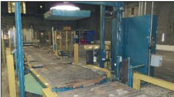
Kaufman Pallet Wrapper