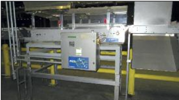
Mettler-Toledo Magna Hi-Spd Switch Check Weigher