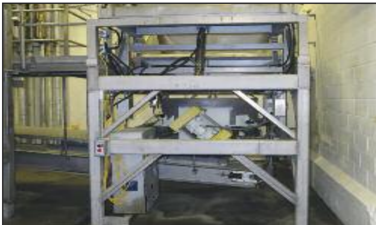
S.S. Bin Dumpers (First Line)