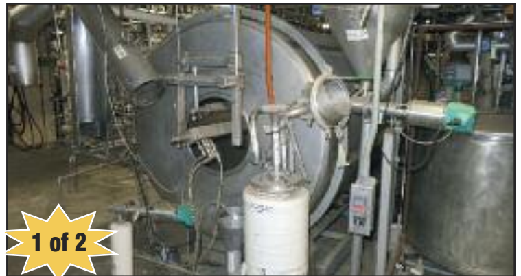
(2) Coating Reels, 3' x 6'