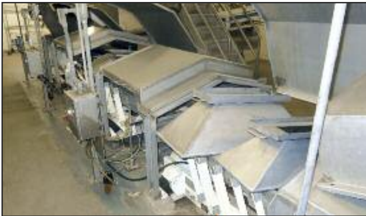
Link Belt 2'x6' Vibratory Feeder

(24) Sylvania Clark M.C.C. Section (Throughout Plant)