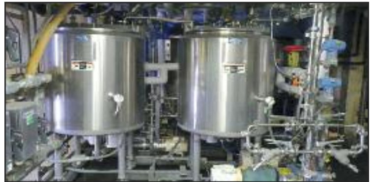
Walker Mix Jacketed Mixing Station

Buhler-Miag Roller Mills; (2) 10hp Motors; (4) 30" x 45' & 20' & 12" S.S. Frame Trough Conveyor, from MPC Dryer; (5) S.S. Shaker Conveyors, 24" x 140", 24" x 107", 24" x 20', 29" x 8'; Steam Injection Hot Water System