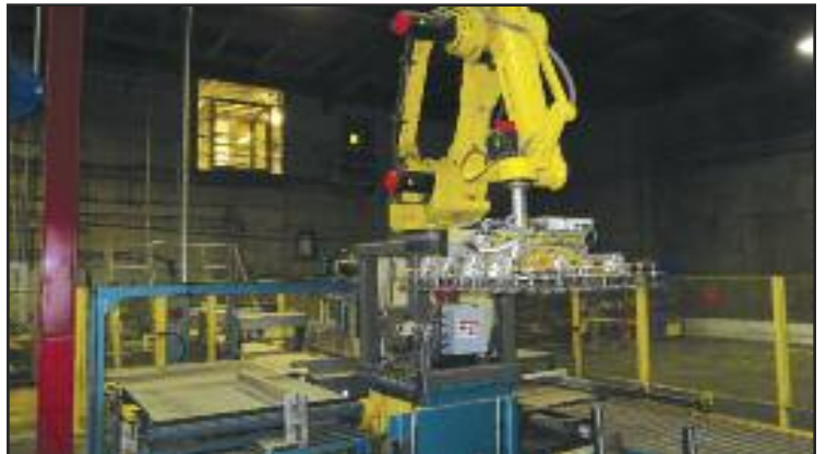
Fanuc M410i Robotic Loader