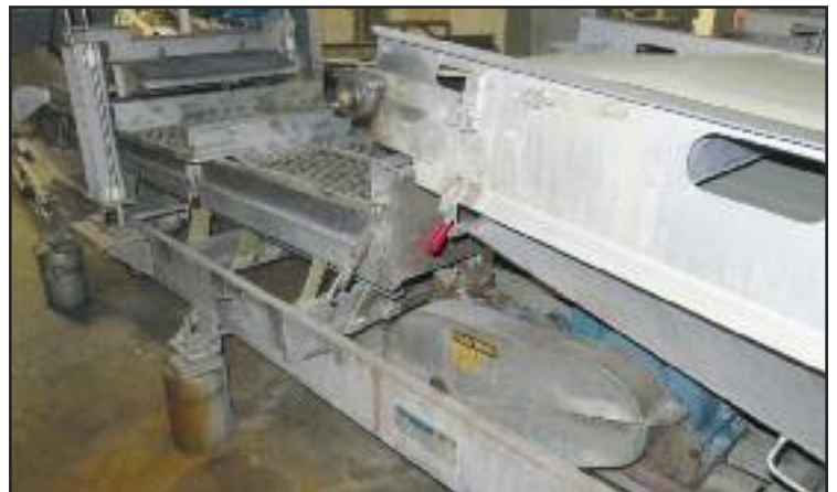
Cardwell 2'x10' S.S. Lump Breaker

Check out our upcoming auction calendar at www.tauberaronsinc.com