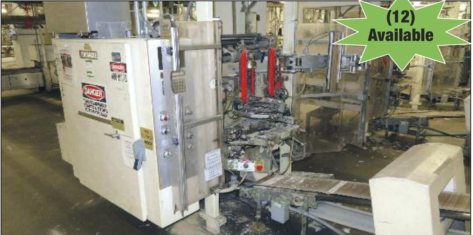
Triangle Form-Fill-Seal Packaging Machines

Line 1 Thru 4 – (4) Currie Mod. LSP-5 Case Palletizers w/Kaufman Pallet Wrapper Labeler