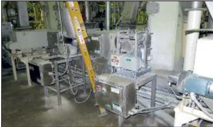
Bran Line w/K-Tron Weigh Scales

Pre-Sweetened Cereal Line: (7) K-Tron Weight Belt Feeders, (3) Mineral Feeders, Rotex 2" x 4' Sifter, Silo, (4) Dbl. Auger Screws 12"x12', Live Bottom, 10" x 20' S.S. Auger Screw, (5) Buhler Air Locks, Buhler Off Loading Air Lock