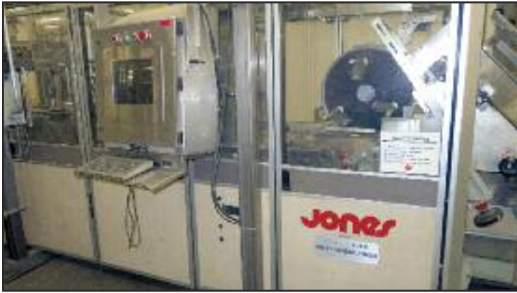
Jones Orbi-Track BFC Former