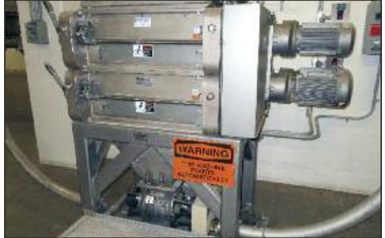
Modern 2-Roll Tack Grinder