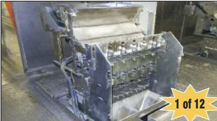
Ishida Selectacon 6-Head & Flexitron Weight Scale Feeders