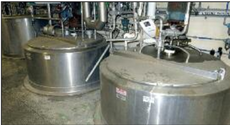
Syrup Mixing System