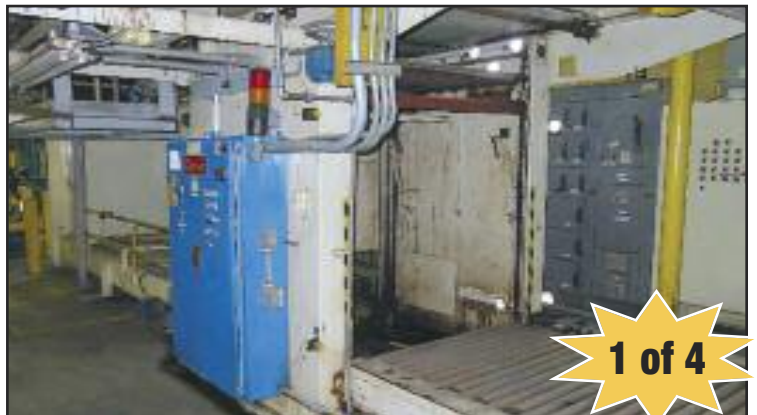
Currie LSP-5 Case Palletizers

Join our mailing list, email us at main@tauberaronsinc.com