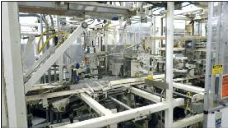
Sure Way 90F Servo Case Erector & Closer