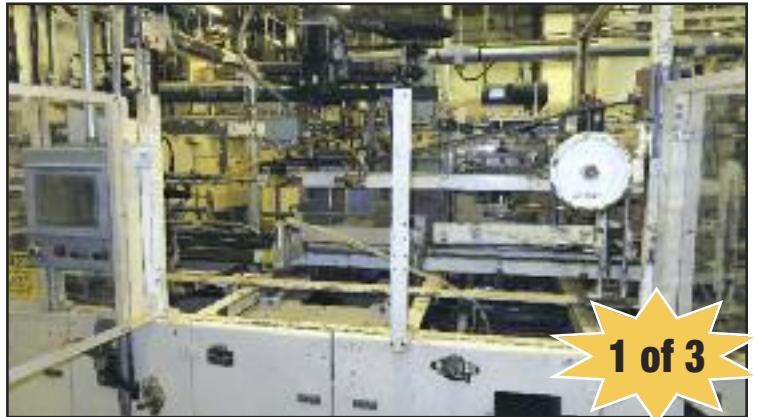
Sure Way M51 Servo Case Erectors & Closers