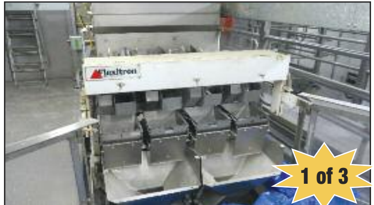
Ishida Flexitron 21-4 Head Weigh Scale Feeders

Former Assets of Post Foods Cereal Manufacturing