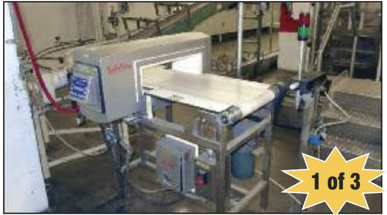
Safeline 6"x16' Metal Detectors