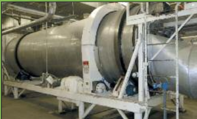
F.M.C. 7' Dia. x 30' Roto Louvre Dryer

Lot #1 Starts Closing: Tuesday, May 16, 10am PDT 901 E. Whitmore Avenue, Modesto, CA 95358