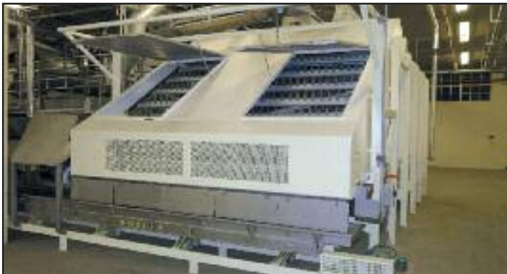
Finished Feed Bin