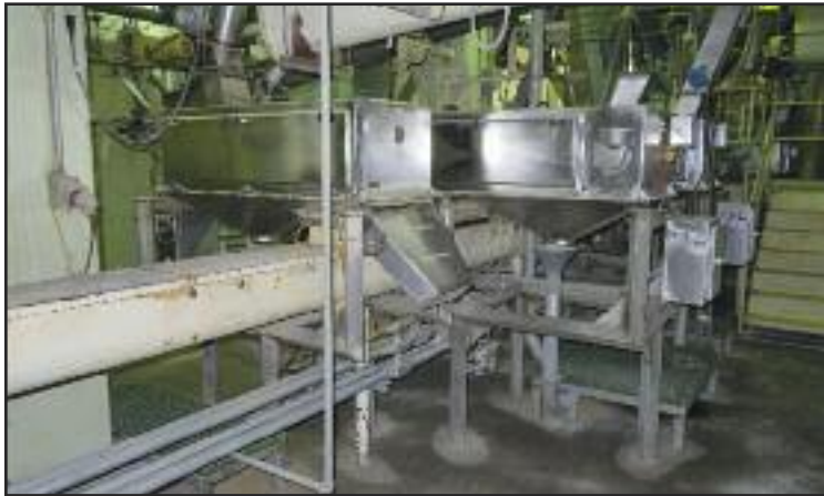
Pre-Sweetened Cereal Line