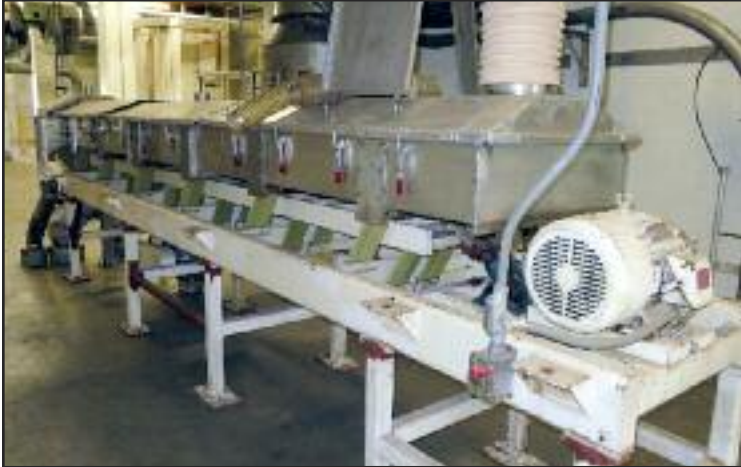
Cardwell S.S. Vibratory Conveyor, 32"x18'

DCE Sintamatic 10hp Dust Collector. Type SU40HS5AD; (2) Flex-Kleen Mod. 84-BV-16-II Dust Collectors. S/Ns 32-51-7228; (2) Horizon Vertical Filters (Silo Feed) w/Rotary Air Lock; (2) Mac S/S Pneumatic Filters w/Rotary Air Lock; (1997) Buhler Type MYFB Flour Return System w/14" Da. x 7' Screw Conveyor. S/N 530519; (5) S.S. Blended Flour Bins, Double Screw Type, Bottom Discharge w/Top Mount Buhler-Miag Dust Collector; Dust Collector Parts Room w/Bags & Filters; Schuler S.S. Syrup & Flour Blend Bin w/Single Screw Discharge; (2) S.S. 10" x 20' Incline Auger Feed Conveyors; Safeline Mod. 333 V2, S.S. Flow-Through Metal Detector. S/N 17179; Assorted 10" S.S. Auger Conveyor; (2011) Waukesha Mod. 018U1 SPX Sanitary Pump. S/N 10000022720779; (4) Assorted Buhler Rotary Air Locks; 10" x 16' S.S. Auger Conveyor; S.S. Overhead Belt Conveyor, 24"W x 75'; (2) Ametek Mod. DR909BE72W Blowers