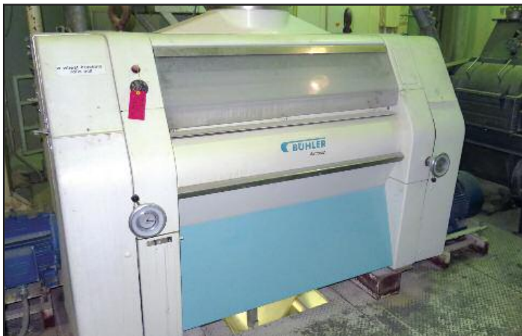
Buhler Wheat Scourer