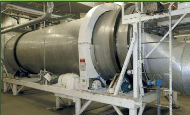
F.M.C. 7' Dia. x 30' Roto Louvre Dryer

Lot #1 Starts Closing: Tuesday, May 16, 10am PDT 901 E. Whitmore Avenue, Modesto, CA 95358