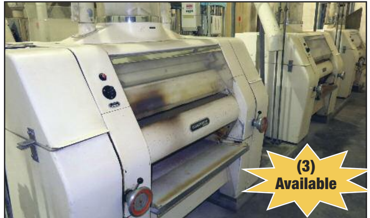
Buhler Miag Mod. 20 Flour Mills