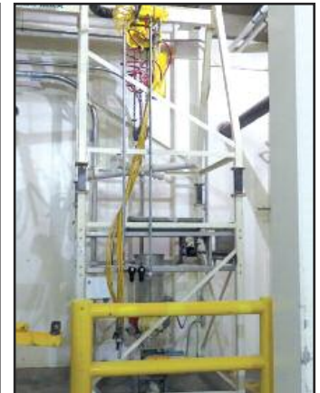
Super Sack Bag Dumper