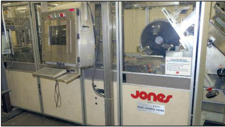
Jones Orbi-Track BFC Former