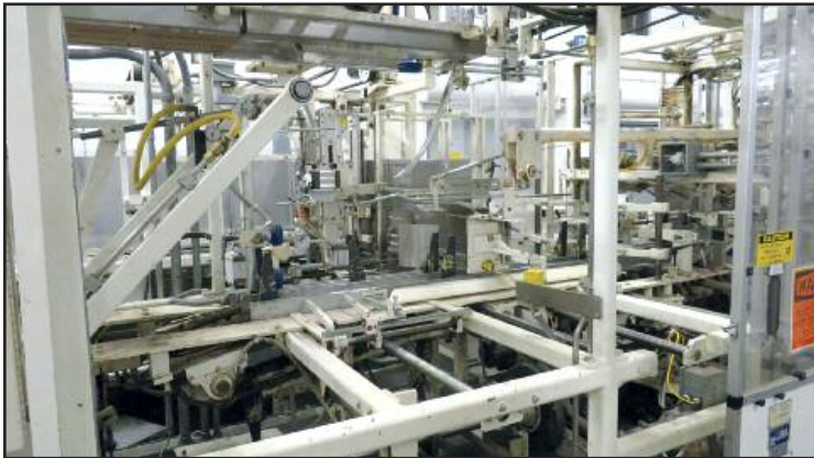
Sure Way 90F Servo Case Erector & Closer