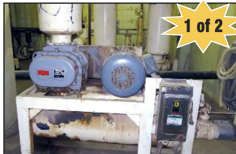
Sutorbilt GDGBRAA, 50hp Vacuum Loaders