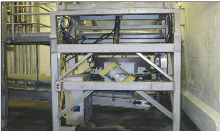
S.S. Bin Dumpers (First Line)