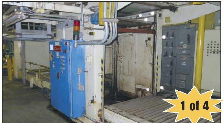
Currie LSP-5 Case Palletizers

Join our mailing list, email us at main@tauberaronsinc.com