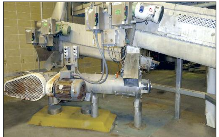
Dual Paddle Conveyor - Blender