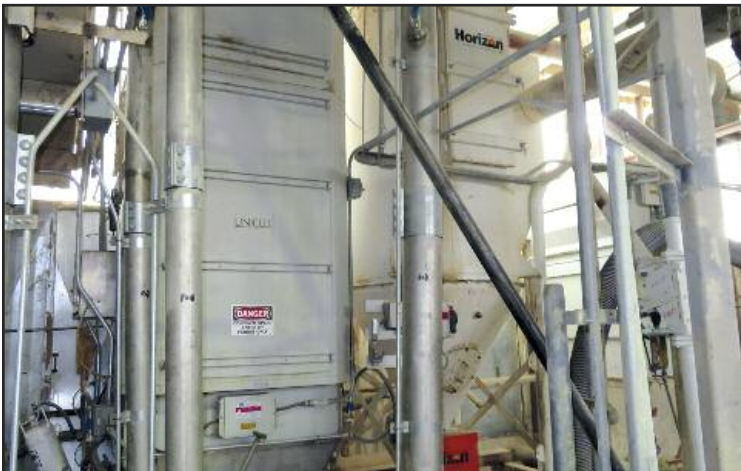
Unicel Dust Collector