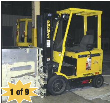
Hyster 5000lb. Electric Forklifts