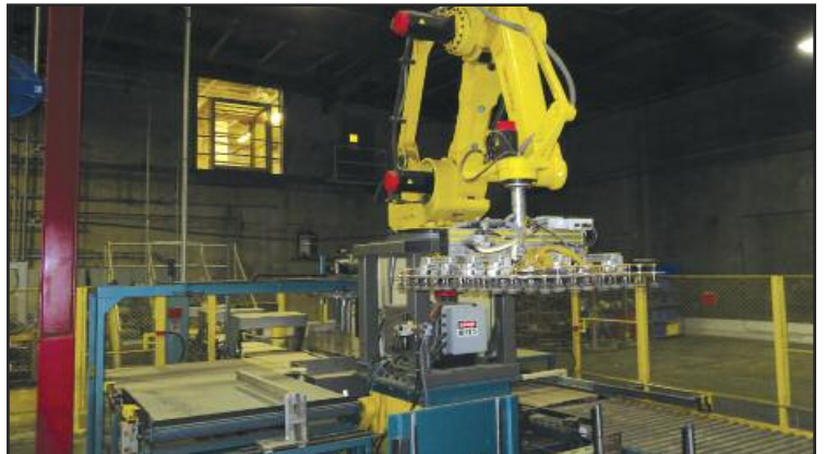
Fanuc M410i Robotic Loader