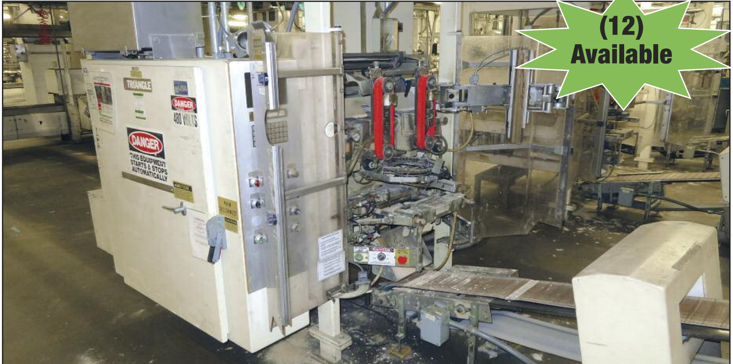
Triangle Form-Fill-Seal Packaging Machines

Line 1 Thru 4 – (4) Currie Mod. LSP-5 Case Palletizers w/Kaufman Pallet Wrapper Labeler