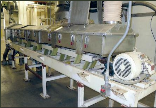
Cardwell S.S. Vibratory Conveyor, 32"x18'

Lot #1 Starts Closing: Tuesday, May 16, 10am PDT