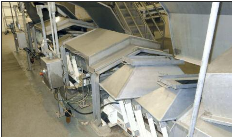
Link Belt 2'x6' Vibratory Feeder

(24) Sylvania Clark M.C.C. Section (Throughout Plant)