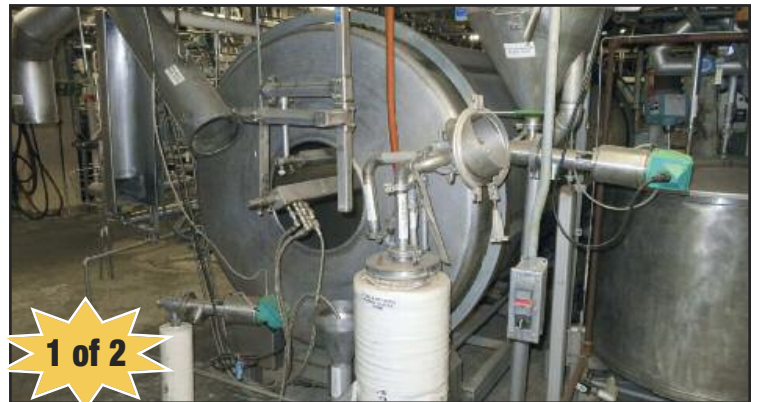
(2) Coating Reels, 3' x 6'