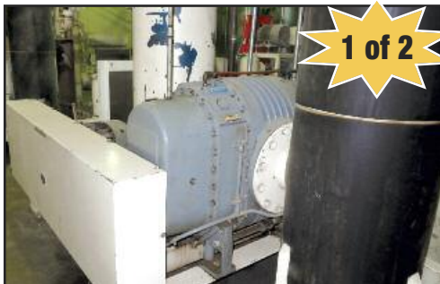
Tuthill 75hp Vacuum Loaders