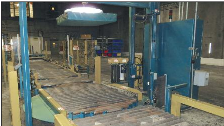
Kaufman Pallet Wrapper