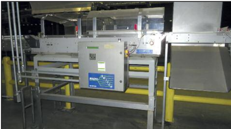
Mettler-Toledo Magna Hi-Spd Switch Check Weigher