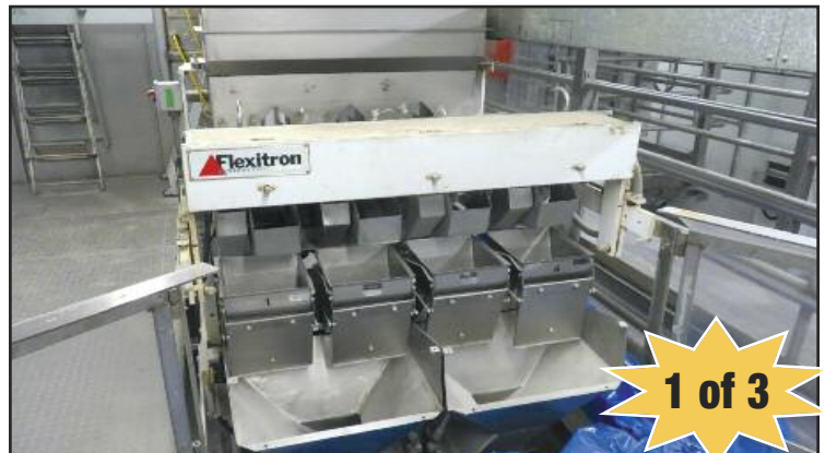
Ishida Flexitron 21-4 Head Weigh Scale Feeders

Former Assets of Post Foods Cereal Manufacturing