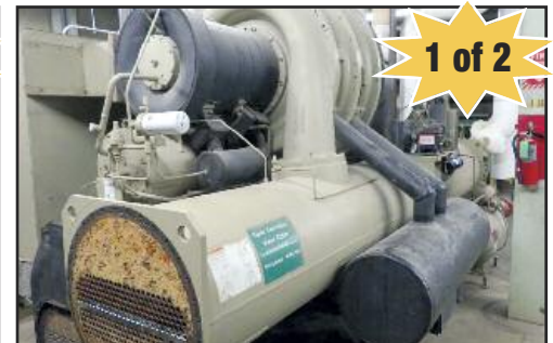
Trane Central Vac Turbo Chillers