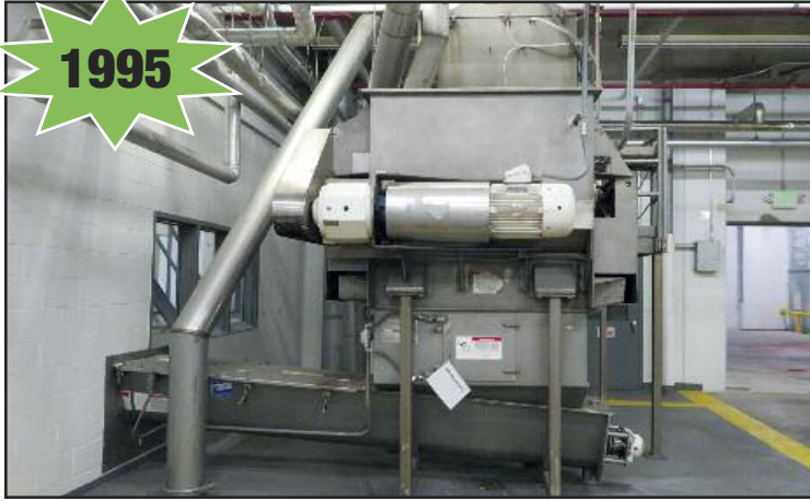
American Process System Mod. HS30 S.S. Dry Coating Mixer

(2006) Buhler Mod. MEAF and MZAH 12 Auger Blender System. S/N 156523/7