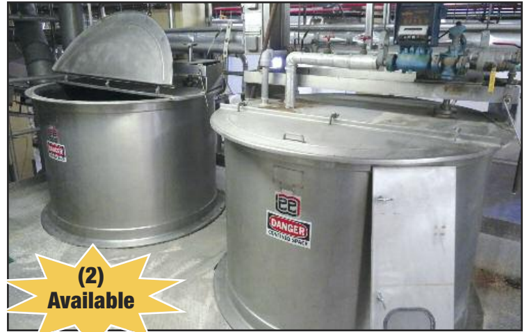
Lee S.S. Mixing Tanks

Assorted Diverter Valves, Blowers & Rotary Air Locks in Sifter Room; (3) S.S. Frame Enclosed Through Conveyor, 16" x 16', 18" x 24' Incline; Carrier Mod. BDL-N2-4150S, 24" x 18' S.S. Vibrating Conveyor, Suspended. S/N 15500; Waukesha Mod. 006 Sanitary Pump. S/N 280509-01; (Lot) Mass Flow Sensors & Assorted Valves; (2) S.S. Paddle Conveyors w/AB Controls; (2) S.S. Lump Breakers, 30hp w/AB Controls; (5) GRC Dust Collectors; (Lot) Micromotion Flow Meters, S.S. Valves, etc.