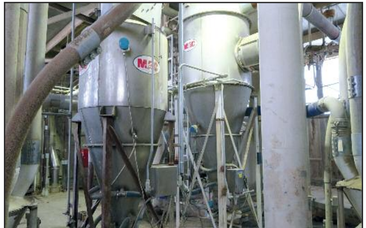
Mac Filter Dust Collector