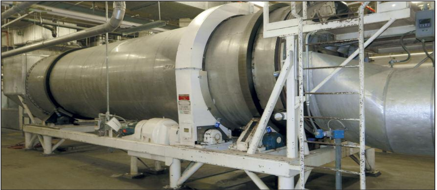
F.M.C. 7' Dia. x 30' Roto Louvre Dryer

Flex-Kleen Dust Collector on 4th & 3rd Floor Tanks; Sweco Mod. ZS40S88WC, Vibro-Energy Separator, Single Deck. S/N 566463-A0503; (Lot) Esco Magnetic Trap & (3) Rotary Air Locks; DCE Unicell Dust Collector; Great Western "HS" Sifter, Double 4' x 22"; Buhler Asperator. S/N 54860150; Mettler Toledo Mod. Lynx Digital Pallet Scale; A.B. McLaughlan S.S. Hydraulic Bin Dump. S/N 5220; S.S. Dump Bin w/Auger Discharge and Horizon Rotary Air Lock; Lot (2) Coating Reels, 36" Dia. x 78"L w/Assorted Mass Flow Sensors, Valves, Flavor Tank, etc.; (4) 30" x 30' and 56' x 26' S.S., 8" x 20' Frame Suspended Belt Conveyor; (2) Key Iso-Flo Mod. 431168-1 S.S. Vibratory Shaker Conveyor, 6" Stroke, 24" x 12' & 78" x 78". S/N 02-87430 & 02-87429; ABM S.S. Frame 28" x 16' Incline Through Conveyor; (2) Key Iso-Flo 30" x 7' x 5' S.S. Vibratory Shaker Conveyor, 6" Stroke; (3) (2002) K-Tron mod. S18028 Continuous Scales, 24" Bed. S/N MD2702012 & MD2802012; (2) Control and Metering Mod. DBW-01-350, 12" Continuous Scale. S/Ns C2735, C2734, n/a; (2) S.S. Surge Bins; AAF Type W Roto-Clone, 10hp; (3) Horizon Twin Roto-Clones w/Twin City 20hp Blower; (2) Sizing Systems w/ BF Gump Auger Feed Conveyor, Modern Process Break Roll, Bucket Elevator w/Platform; (2) S.S. Multi-Deck Vibratory Screens, 40" x 40"; (2) S.S. & Mild-Steel Bin Dumps; (Lot) Assorted Rotary Air Locks, Blowers