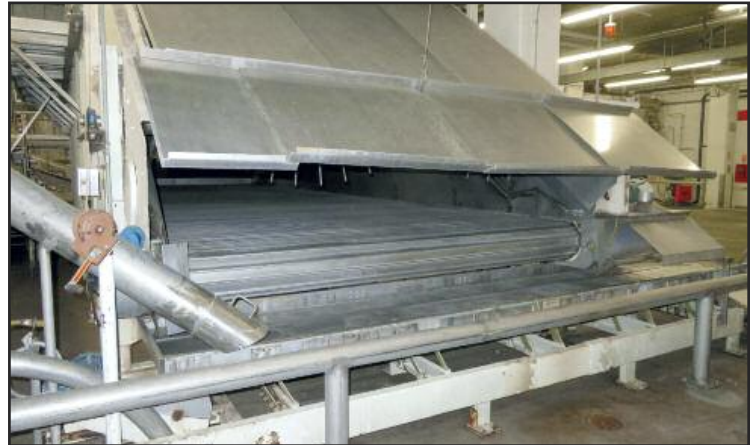
10' x 30' S.S. Finish Bin Holding Silo