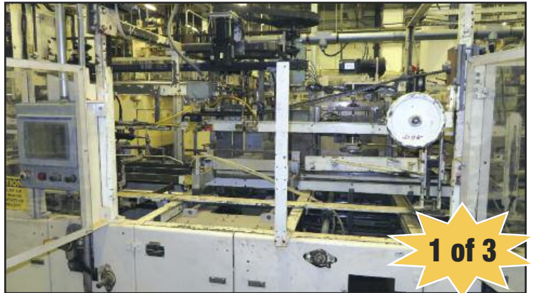
Sure Way M51 Servo Case Erectors & Closers