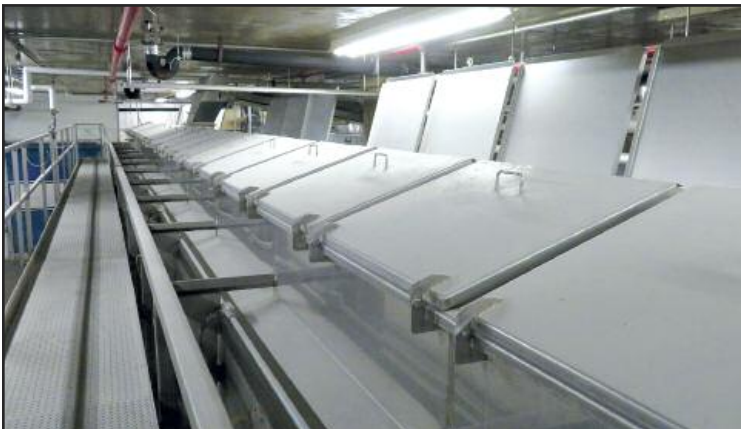
Shoulder Bros. 6' x 60' 'Accumaveyor' Surge Bin