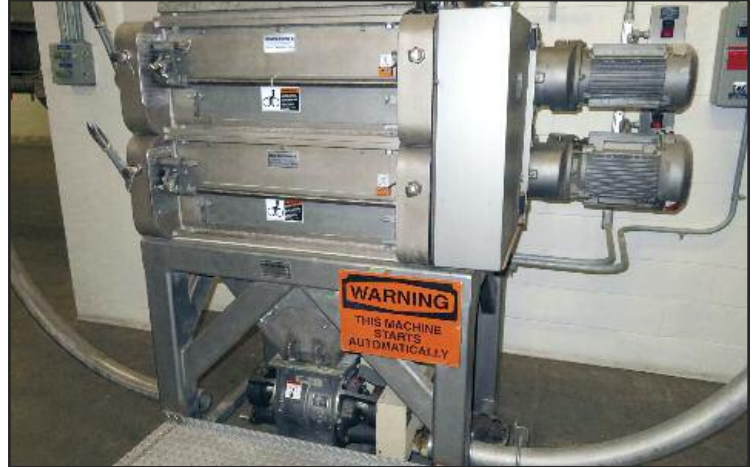
Modern 2-Roll Tack Grinder