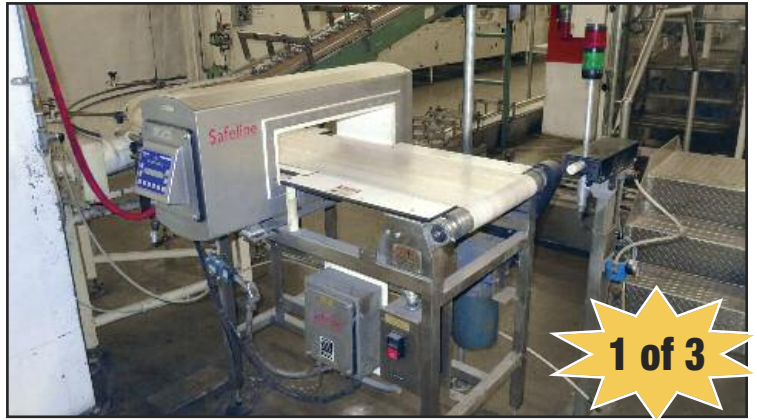
Safeline 6"x16' Metal Detectors