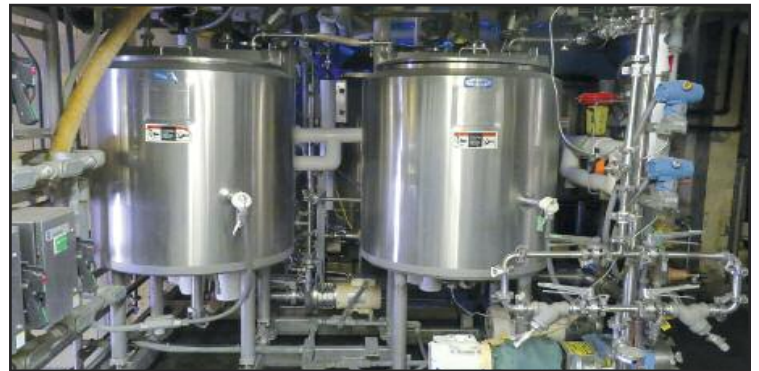
Walker Mix Jacketed Mixing Station

Buhler-Miag Roller Mills; (2) 10hp Motors; (4) 30" x 45' & 20' & 12' S.S. Frame Trough Conveyor, from MPC Dryer; (5) S.S. Shaker Conveyors, 24" x 140", 24" x 107", 24" x 20', 29" x 8'; Steam Injection Hot Water System