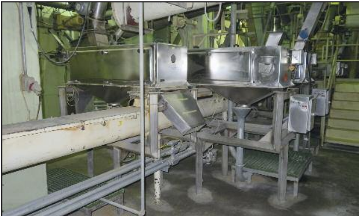
Pre-Sweetened Cereal Line