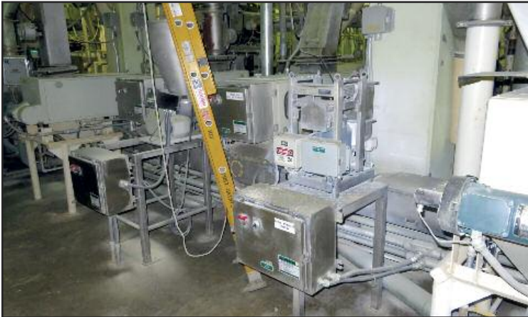
Bran Line w/K-Tron Weigh Scales

Flake S.S. Chute w/Safeline Inline Metal Detector, Feeding to Packaging; Waste Offload to Slurry Pumping Station; S.S. 'V' Blender (Approx. 20 C.F.); Forberg 3' x 3' Coconut Hammer Mill