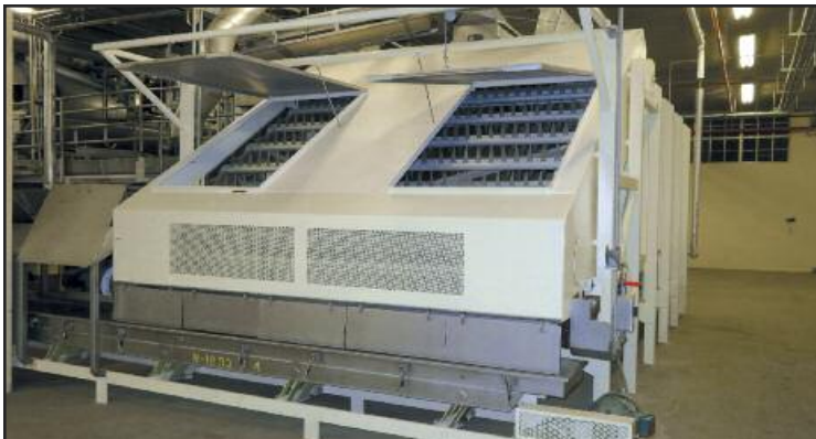
Finished Feed Bin