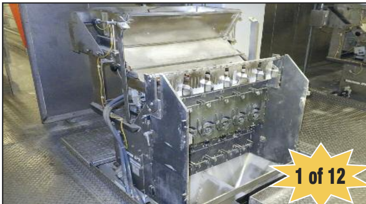
Ishida Selectacon 6-Head & Flexitron Weight Scale Feeders