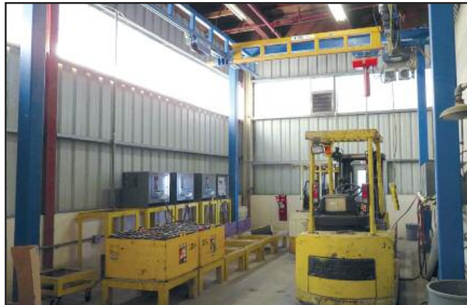
Gorbel Battery Hoist System