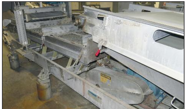
Cardwell 2'x10' S.S. Lump Breaker

Check out our upcoming auction calendar at www.tauberaronsinc.com