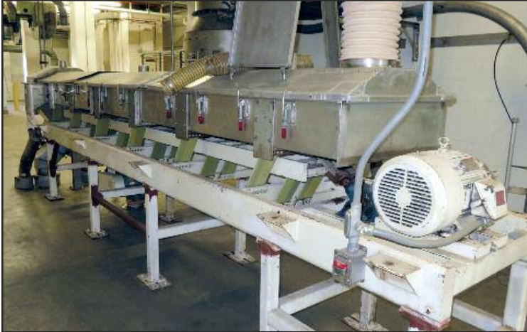
Cardwell S.S. Vibratory Conveyor, 32"x18'

DCE Sintamatic 10hp Dust Collector. Type SU40HS5AD; (2) Flex-Kleen Mod. 84-BV-16-II Dust Collectors. S/Ns 32-51-7228; (2) Horizon Vertical Filters (Silo Feed) w/Rotary Air Lock; (2) Mac S/S Pneumatic Filters w/Rotary Air Lock; (1997) Buhler Type MYFB Flour Return System w/14" Da. x 7' Screw Conveyor. S/N 530519; (5) S.S. Blended Flour Bins, Double Screw Type, Bottom Discharge w/Top Mount Buhler-Miag Dust Collector; Dust Collector Parts Room w/Bags & Filters; Schuler S.S. Syrup & Flour Blend Bin w/Single Screw Discharge; (2) S.S. 10" x 20' Incline Auger Feed Conveyors; Safeline Mod. 333 V2, S.S. Flow-Through Metal Detector. S/N 17179; Assorted 10" S.S. Auger Conveyor; (2011) Waukesha Mod. 018U1 SPX Sanitary Pump. S/N 10000022720779; (4) Assorted Buhler Rotary Air Locks; 10" x 16' S.S. Auger Conveyor; S.S. Overhead Belt Conveyor, 24"W x 75'; (2) Ametek Mod. DR909BE72W Blowers