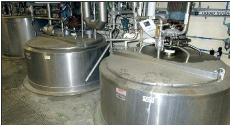
Syrup Mixing System