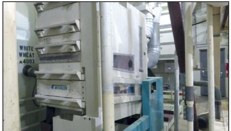
Buhler MTKB65/1200 Wheat Cleaner

Join our mailing list, email us at main@tauberaronsinc.com