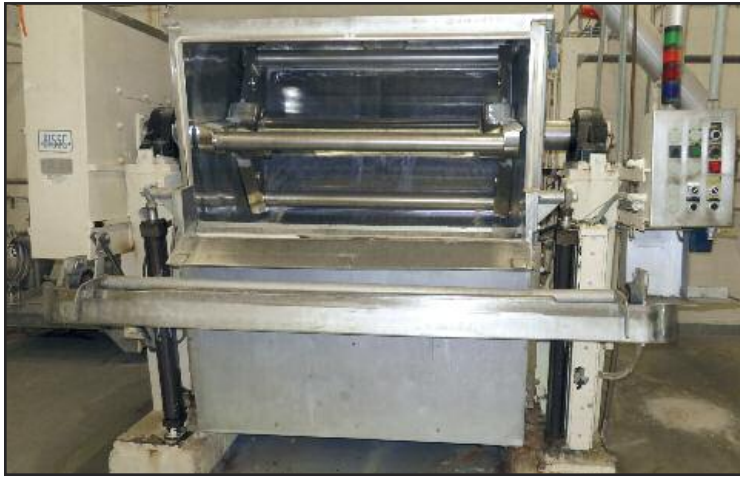
Baker Perkins 2000lb Roller Bar Dough Mixer