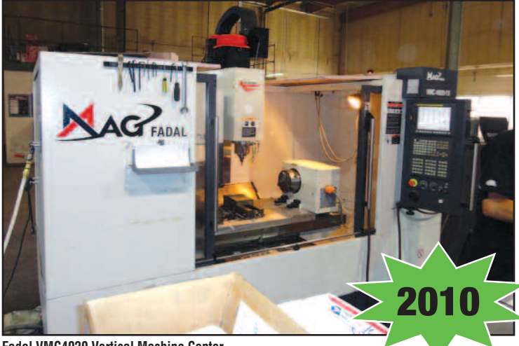
Fadal VMC4020 Vertical Machine Center

(2007) Fadal Mod. VMC4020FX Vertical Machine Center, S/N 012007111247