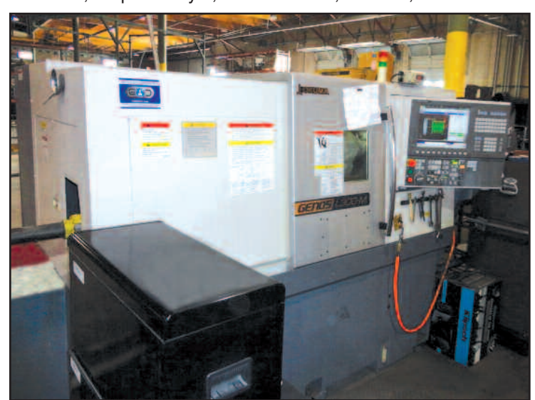
Okuma Genos L300-M CNC Turning Center

Okuma Mod. Genos L300-M, CNC Turning Center, 12-Position Turret, Prog. Tailstock, Live Tooling, OSP-P200L-R Controls, Bar Feed, Chip Conveyor, Flood Coolant, Air Blow, S/N PA150