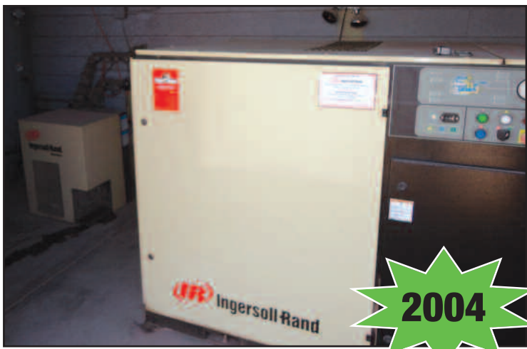
Ingersoll Rand 40hp Rotary Screw Air Compressor