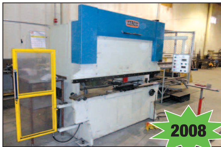
Raleigh 6' Power Press Brake