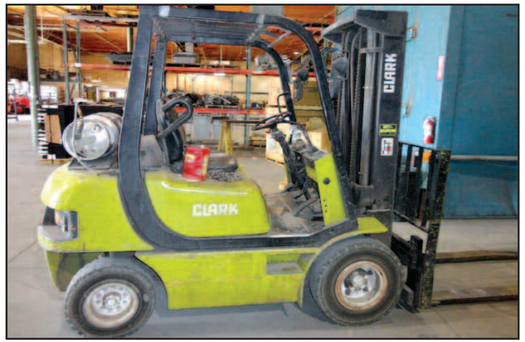
Clark 5,000 Lb. LPG Forklift

TCM Mod. FG20NZ, 4000lb LPG Forklift, S/N 66401954 Speedaire 10hp Tank-Mtd. Air Compressor; BurrKing Mod. 760, 2" Belt Sander; Central Vapor Blast Cabinet; 2' x 3' Vibratory Finishing Mill; Strippit Die Grinder; Chicago 12" Vib. Finishing