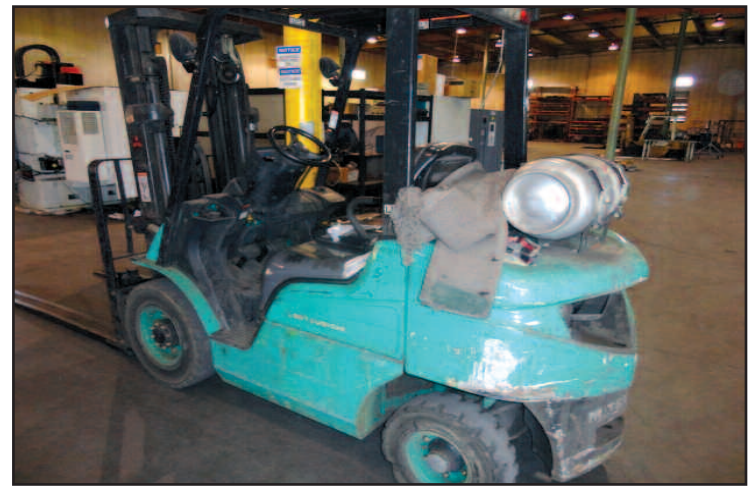
Mitsubishi 4.000 Lb. LPG Forklift