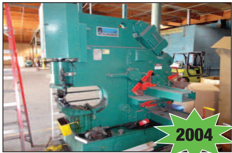
Hill Acre 100-Ton Punch Hydraulic Ironworker