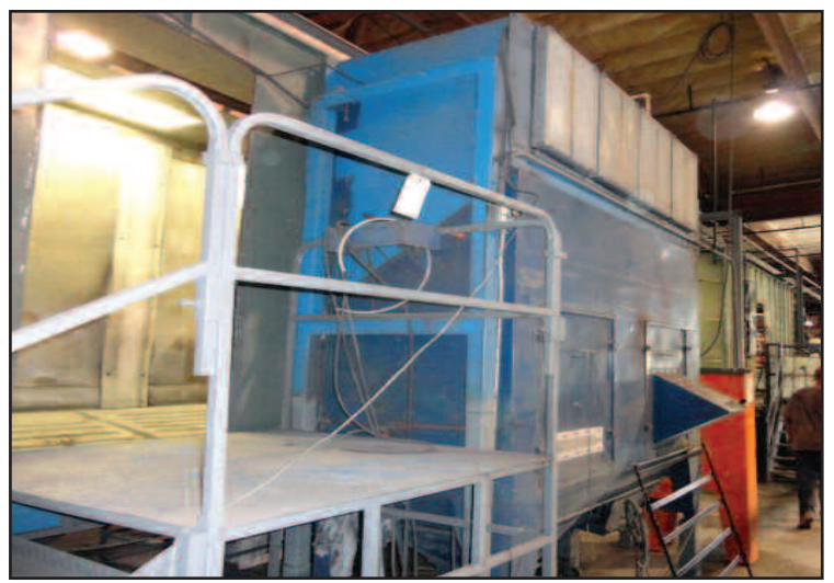
Views of Nordson Powder Coat Spray System