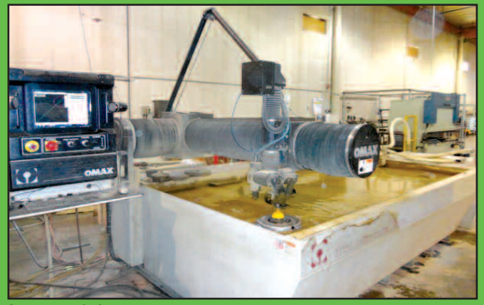
Omax 55100 CNC Water Jet Machine

Wednesday, March 8th at 11:00am 2265 Crosswind Drive, Prescott, AZ