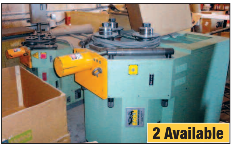
Eagle Angle Bending Rolls

(2001) Eagle CH60, Vert. Angle Bending Roll, S/N 2001B024 (1999) Eagle CPH40, Vert. Angle Bending Roll, S/N 99G0007 Greenlee 885, Hyd. Bender w/Hyd. Pump & Dies Greenlee 884, Hyd. Bender w/Dies