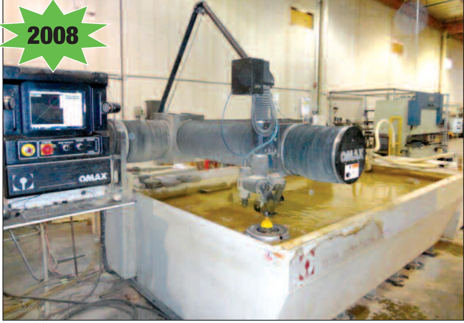
Omax 55100 CNC Water Jet Machine

(2008) Omax Mod. 55100 CNC Water Jet Machine, 60,000 PSI, Mod. P4055V Intensifier (S/N P722898), Myers Pump (S/N 500141121), PC Controlled, 55" x 100" Travels, S/N B511744