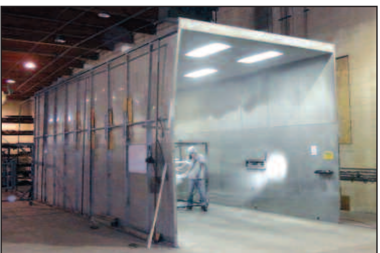
Wagner Powder Coat Spray Booth