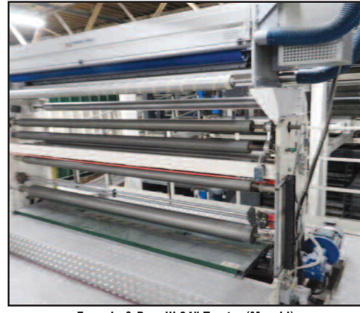
Ferrarin & Benelli 94" Treater (Macchi)