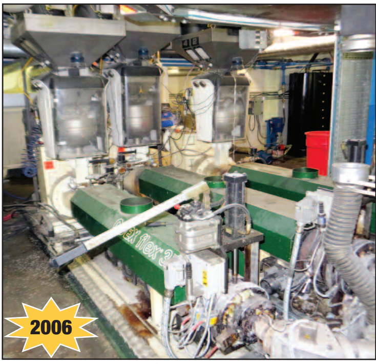
Macchi 3-Layer Blown Film Line

Cost to dismantleand load, not including electrical disconnection: $12,000.00, This amount will be added to your invoice, with no BP or sales tax.