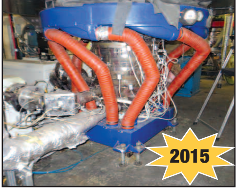
Lung Meng 500mm I.B.C. Die