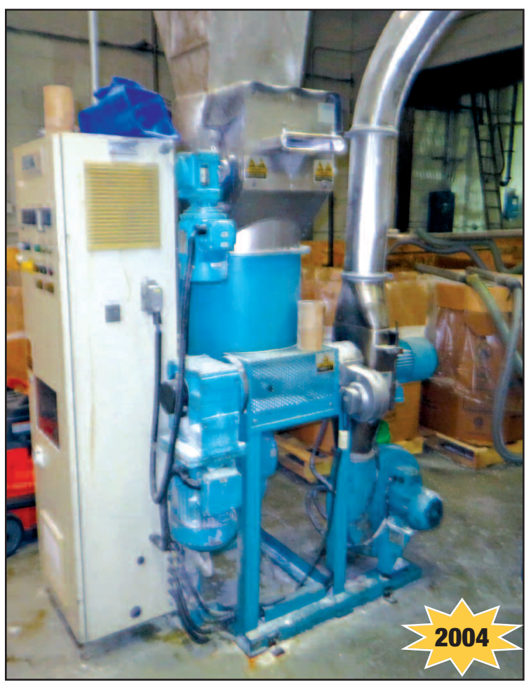
Erema Trim Recovery

(2015) AEC Mod. GCRC-175, 50-Ton Dual Stage Chiller w/ 1600 Gal. Recovery & Recirculating Tower, Remote Condenser • (2015) I.R. Mod. VP6-50 PEI-150 H.P. Rotary Screw Air Compressor w/ Zeks Dryer • I.R. SSR EP25SE, 25hp Rotary Screw Air