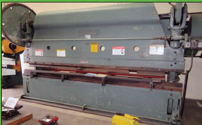
Cincinnati 12' x 90 Ton Press Brake

ASSET LOCATION: 3100 W. Central Ave, Santa Ana, CA