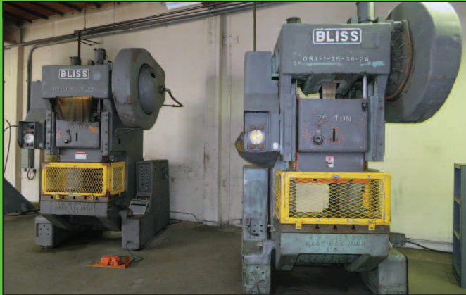
(2) Bliss 75 Ton OBI Punch Presses

ASSET LOCATION: 3100 W. Central Ave, Santa Ana, CA