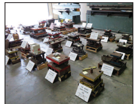
Product Line Dies