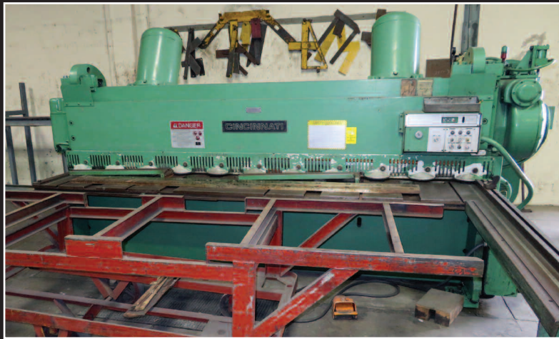
Cincinnati Mod. 2CC10, 10' x 1/4" Shear