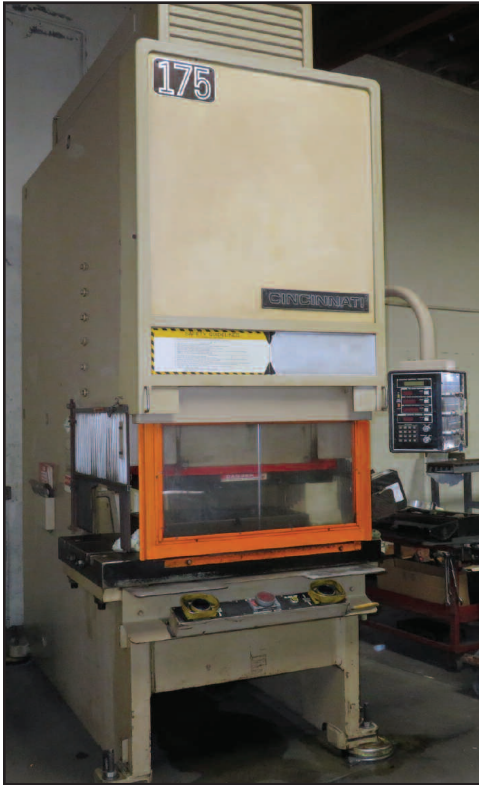
(1983) Cincinnati Mod. 175 OBS Punch Press