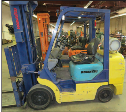
Komatsu FG25, 4000 Lb. Forklift