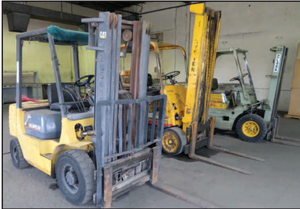
View of Forklifts