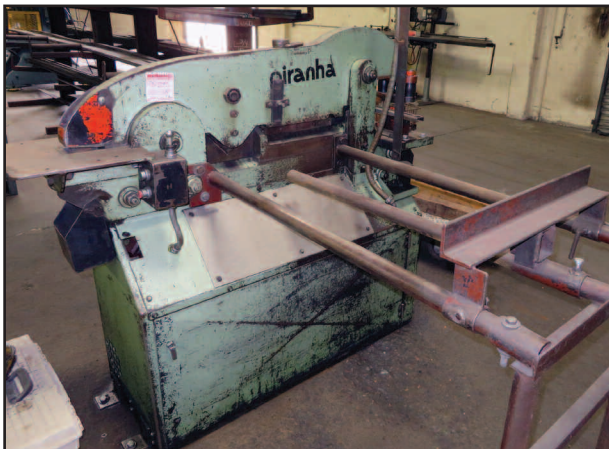
Piranha P-3 Iron Worker

Mubea Mod. HP250 Iron Worker. S/N 015408803571290