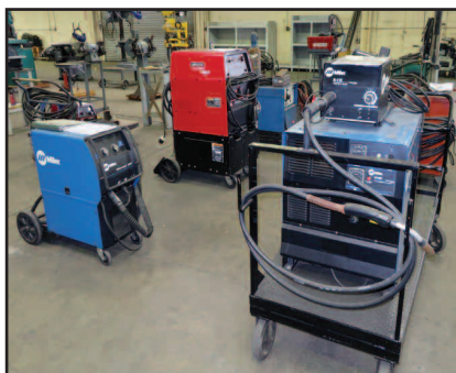
View of Welders