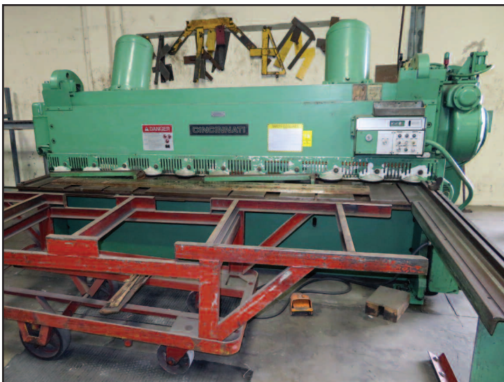
Cincinnati Mod. 2CC10, 10' x 1/4" Shear

Chicago 56A, 10' x 40-Ton Press Brake. S/N 18480