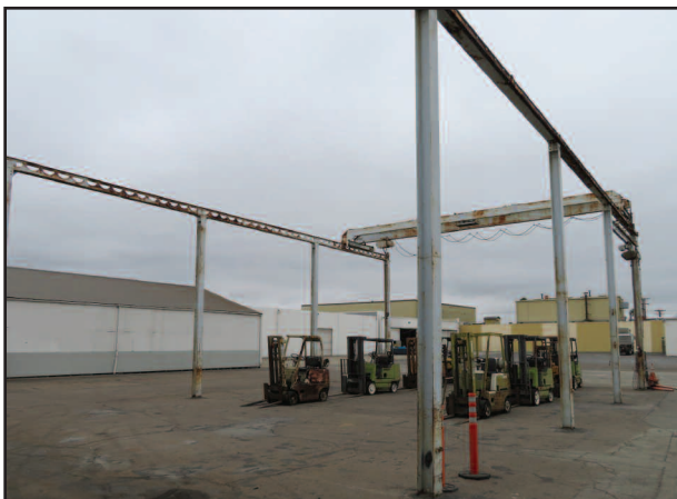
Free Standing Bridge Crane System

Name, Logo, Tel#, Dies, Email Address, Web Parts, Mailing Lists; Approx. 300,000 Blue Prints for Sea Ray, Malibu, Connect Craft, Catalina Sail Boats, Bayliner, Boston Whaler