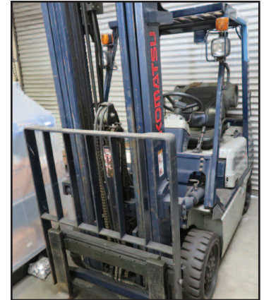
Komatsu FG30, 5000 Lb. Forklift