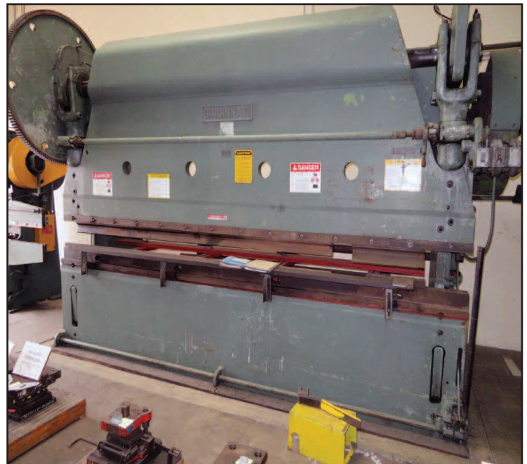
Cincinnati 12' x 90 Ton Press Brake

For more Information, visit our website: www.tauberaronsinc.com