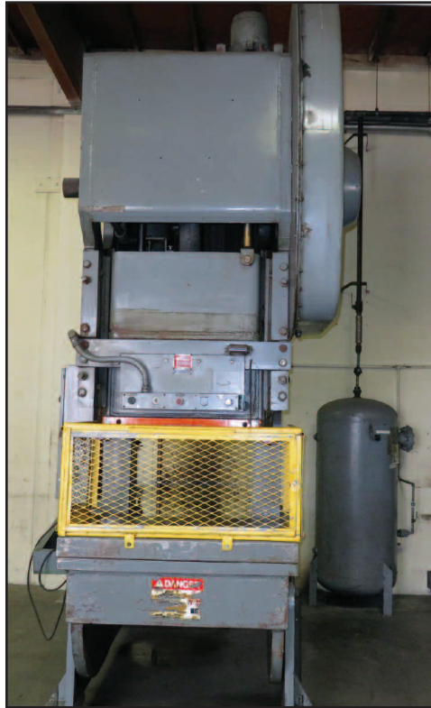
Bliss C-150 Ton OBI Punch Press