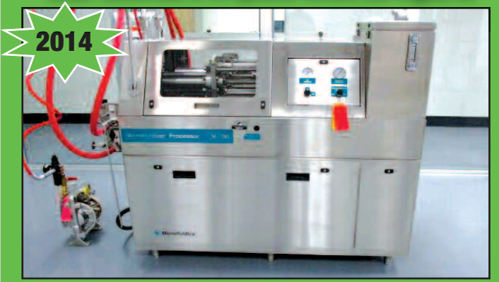
Microfluidics M700, Mod. 7250-30K Micro Fluidizer