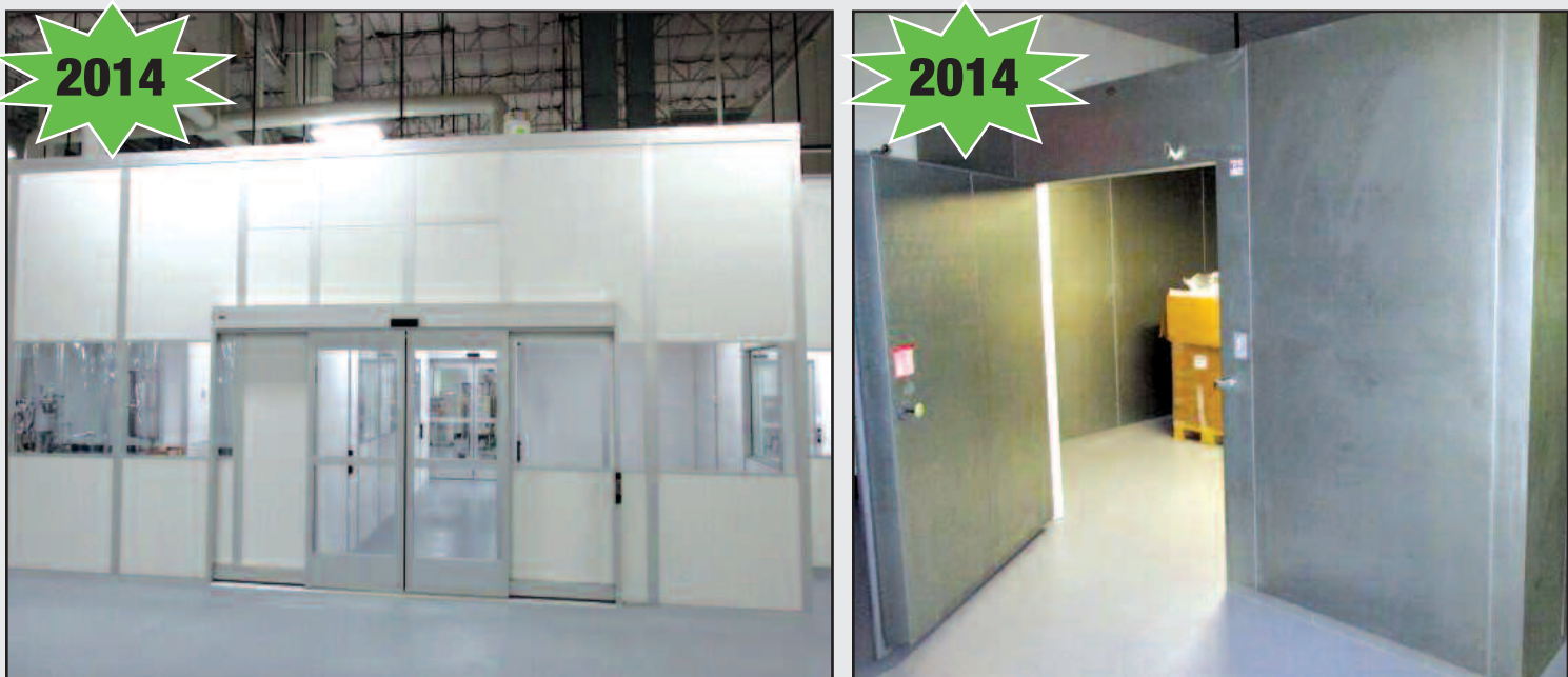
ACS 4000 Sq. Ft. Modular Clean Room

(2014) Bush Carroll 16' x 16' x 8' Walk-In Cooler, Fully Modular. S/N C1-233673