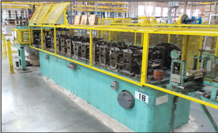
Radco 10" x 13 Stand x 1-1/2" Arbors

INSPECTION DATES: Mon. & Tues., October 19th & 20th, 9 a.m. to 4 p.m. & Morning of the Sale