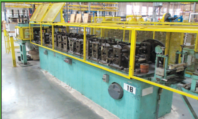
Radco 10" x 13 Stand x 1-1/2" Arbors