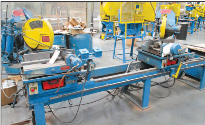
Haberle Dbl. Miter Chop Saw