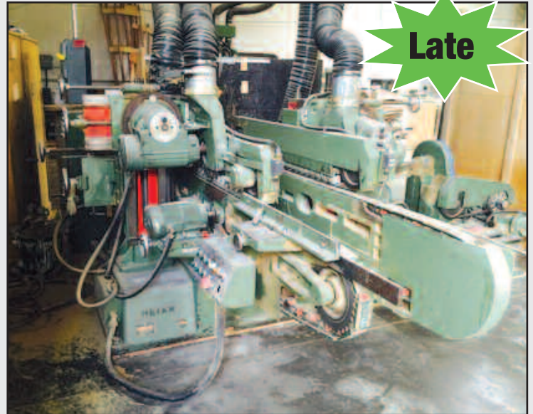
Heian WS-66-V Dbl End Tenoner