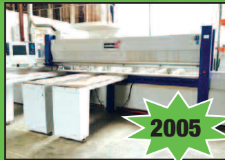
Schelling FX-H 430/410 CNC Horizontal Panel Saw

TA TAUBER-ARONS, INC. Industrial Auctioneers & Liquidators since 1892 13848 Ventura Boulevard • Sherman Oaks, CA 91423 Phone: (323) 851-2008 • (888) 648-2249 Fax: (818) 933-0782 http://www.tauberaronsinc.com E-mail main@tauberaronsinc.com