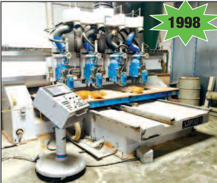
Shoda MAXXIM Vertical CNC Router