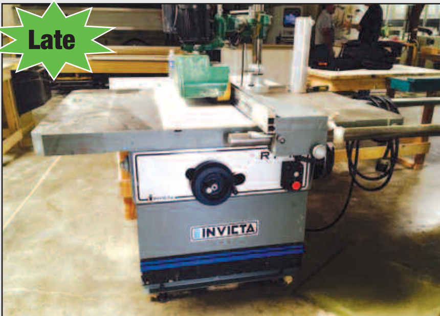
Invicta RT40 Table Saw

Silhouette Tool Grinder; Curtis Tank-Mounted Air Compressor; Combo Cyclone/Bag House Dust Collector; Rotary Screw Air Compressor; Powermatic Table Saw; Southworth 48" Rotary Lift Table, 4000lb; Jet Drill Press; IMC Fanuc Router; Champ Ford Multi Spindle Drill; Quincy 50hp Vacuum Press; Rayco Horiz. Drill; International 25hp Vacuum Pump