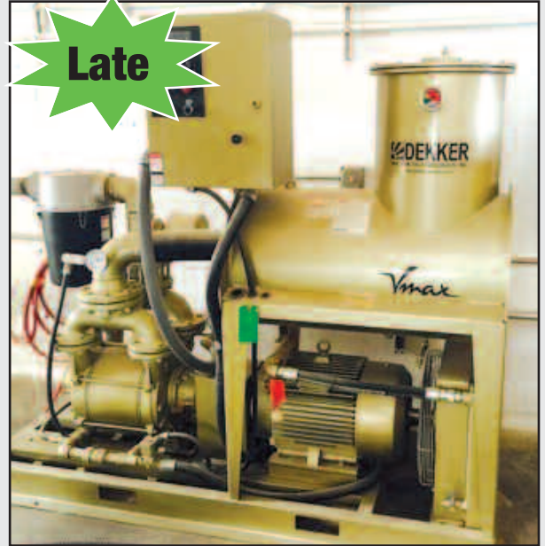
Dekker Vacuum Pump