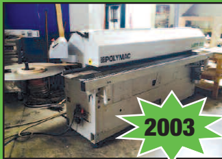
Polymac LATO 235 Single Sided Edge Bander

INSPECTION: Wed., May 27th, 9am to 4pm and Morning of the Sale