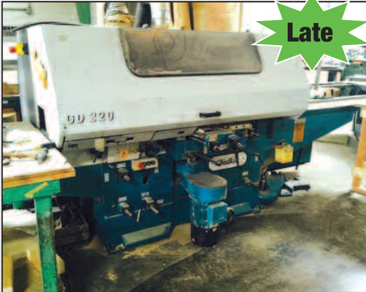
Wadkin GD 220, 5-Head Molder

Wadkin GD 220, 5-Head, 9", Variable Speed Moulder w/Central Lube, Digitals