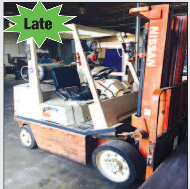
Nissan 6000lb LPG Forklift

INSPECTION: Wednesday, May 27th, 9:00am to 4:00pm and Morning of the Sale