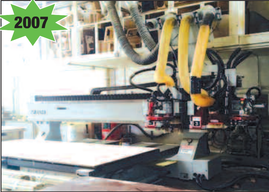
Andi Exact Plus Duo Vertical CNC Router