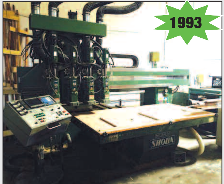
Shoda NC-516-EX Vertical CNC Router