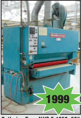
Butfering Type AWS E-1350, 52" Single Drum Wide Belt Sander