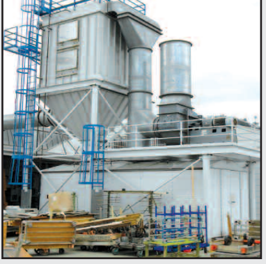
Donaldson/Torit 100hp Cyclone Dust Collection System