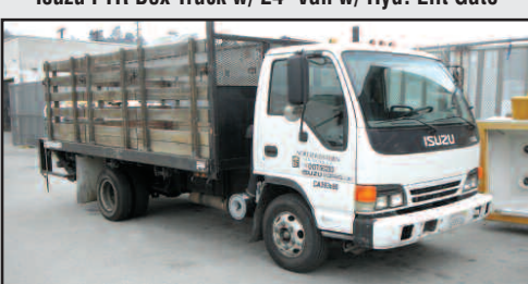
Isuzu NPR-HD Stake Bed Pick Up Truck