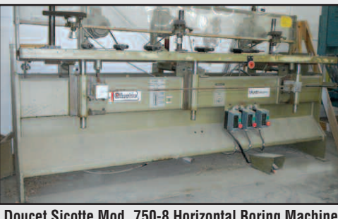
Doucet Sicotte Mod. 750-8 Horizontal Boring Machine