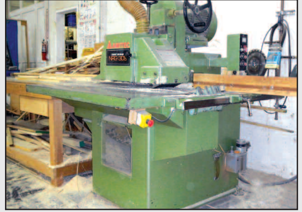
Amitec Mod. NRG-30S, Straight Line Rip Saw