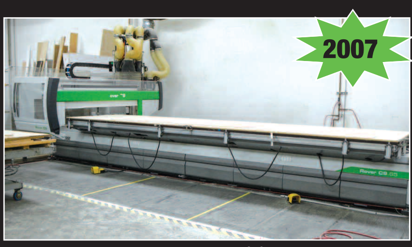
Biesse Rover 5-Axis Vertical CNC Router