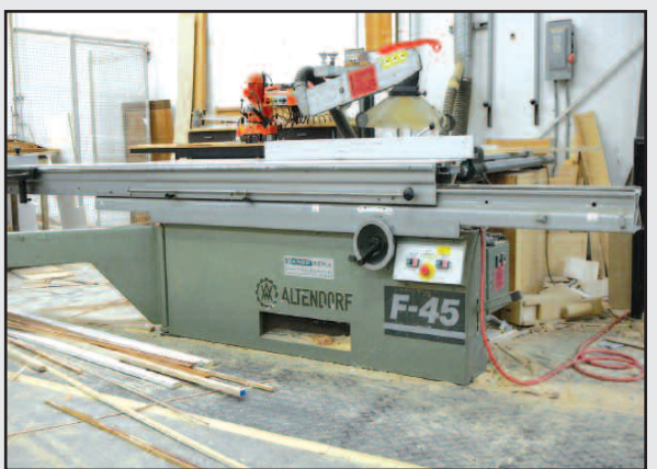
One of (3) Altendorf Mod. F-45, Sliding Bed Table Saws