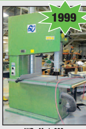
N'Ra Mod. 900, 36" Vertical Band Saw