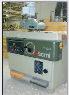
SCMi Mod. T 130 Single Spindle Shaper