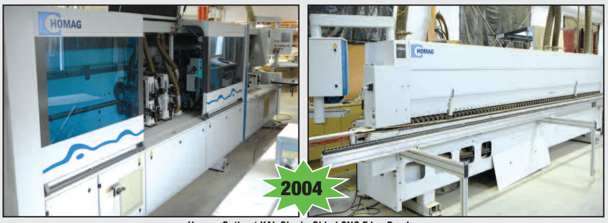
Homag Optimat KAL Single-Sided CNC Edge Bander