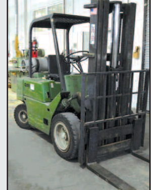
Clark 5000lb. LPG Forklift