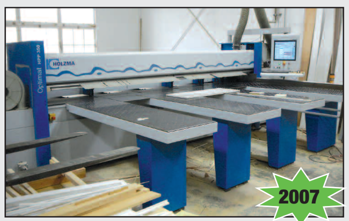
Holzma Optimat HPP 350/43/43, 12' Horizontal CNC Panel Saw