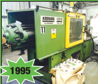
Arburg Allrounder Mod. 420M-1000-250 Injection Molder

ASSET LOCATION: 6006 Shull St., Bell Gardens, CA