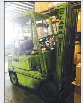
Clark 4000lb. LPG Forklift