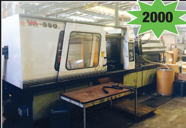
Nan Rong Mod. TNR 350 LCD Injection Molder