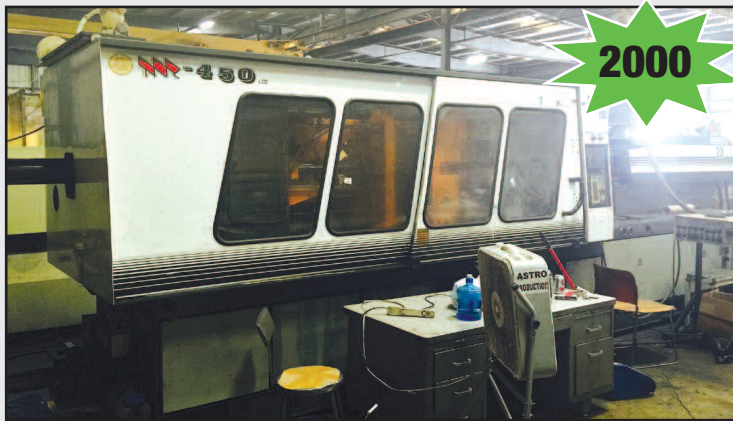
Nan Rong Mod. TNA450-LCD Injection Molder