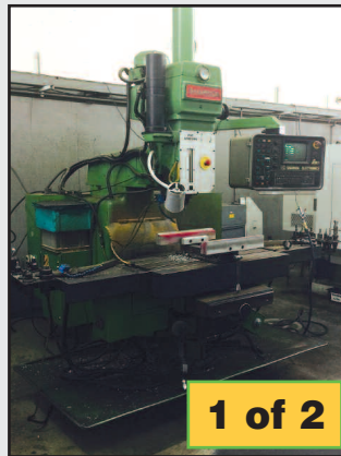
Sharnoa CNC Vertical Mills