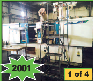
LK Machinery Potenza 200 Ton Injection Molders

TAUBER-ARONS, INC. Industrial Auctioneers & Liquidators since 1892