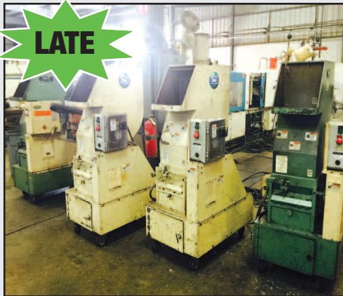
Partial View of IMS Scrap Grinders