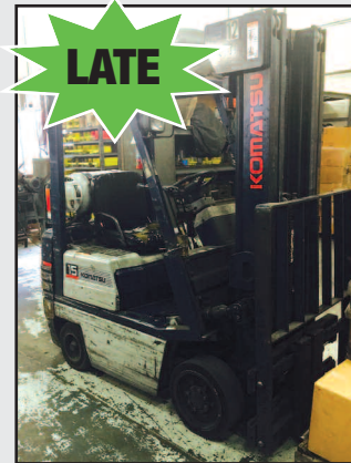
Komatsu 4000lb. LPG Forklift