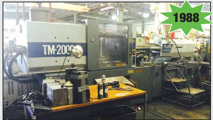
Toyo Plastar Mod. TM200G, 200 Ton Injection Molder