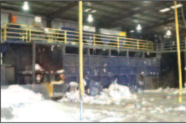
Paper Recycling Center

INSPECTION: Wed., Oct. 8th, 9:00 a.m. to 4:00 p.m. and Morning of the Sale