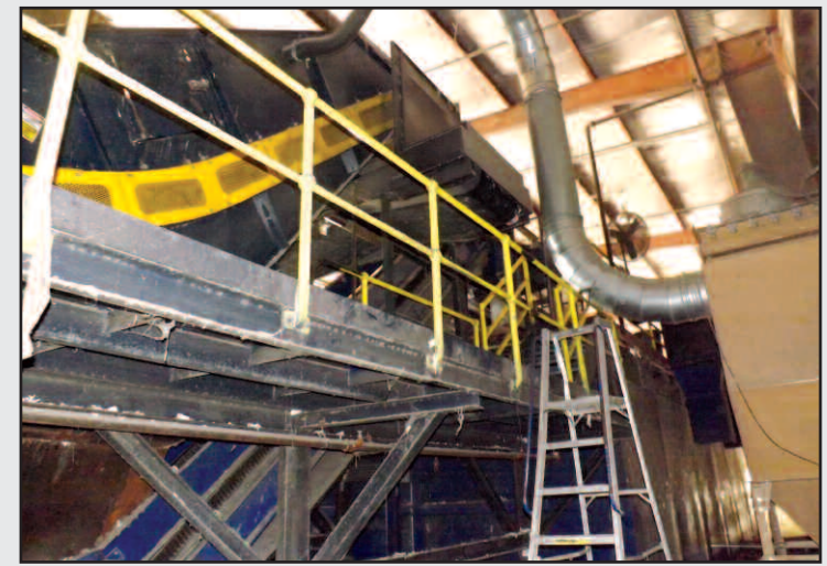
Views of Recycling Line

LOCATION: 8038 N. Palafox Street, Pensacola, FL 32534