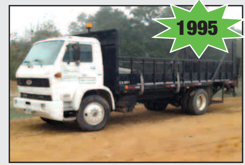
Peterbilt Flatbed Truck