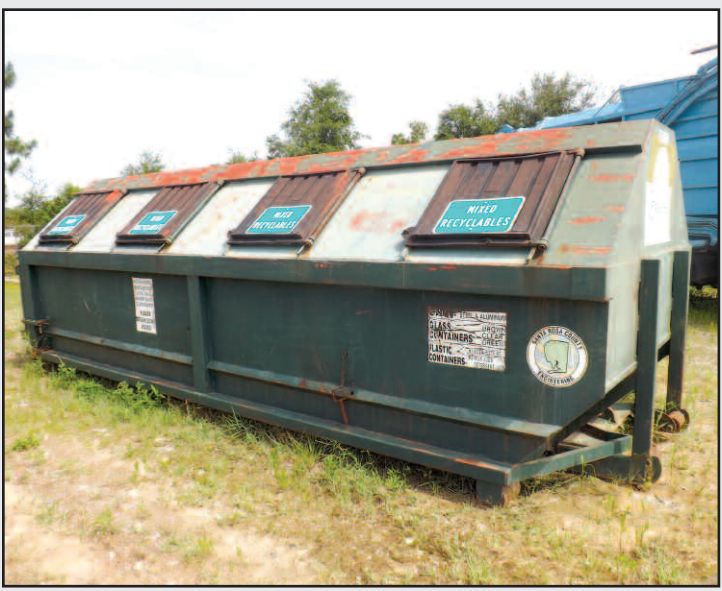
20 Yd Enclosed Rolloff

(28) 3-Yard Trash Hoppers; (3) 20-Yard Enclosed Rolloff Containers; (36) 6-Yard Trash Hoppers; (4) 20-Yard Rolloff Containers, Open-Top; 15-Yard Rolloff Container, Open-Top; (7) 40-Yard Rolloff Containers; (30) 20' Storage Containers