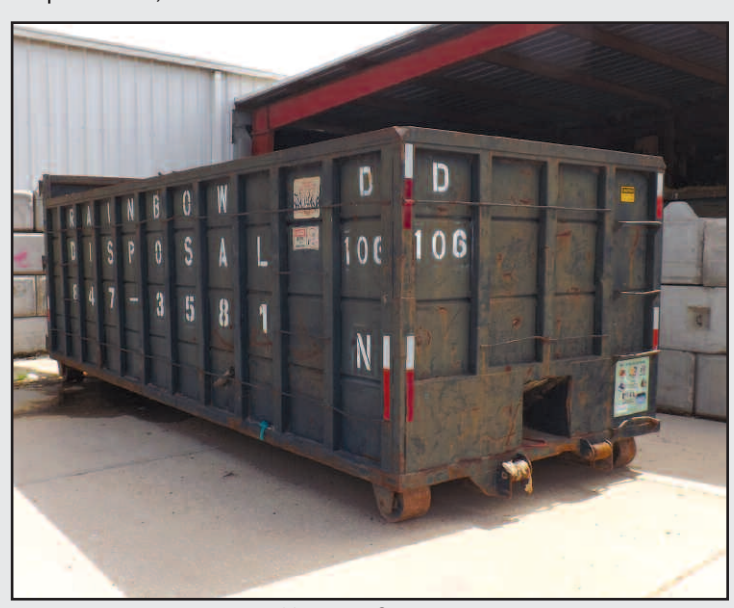
20' Rolloff Container

(3) Diesel Fuel Walls; 10' x 45' Mobile Office; Scotsman Ice Maker; Hobart Generator; (2009) Kaeser Mod. SK15, 15 H.P. Rotary Screw Air Compressor w/ Receiving Tank; Lincoln 400 Amp. Welder; Craftsman Port. A/C