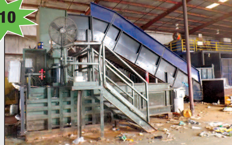
Harris Selco Mod. 2R-1050-BR, 50 H.P. Dual Ram Baler