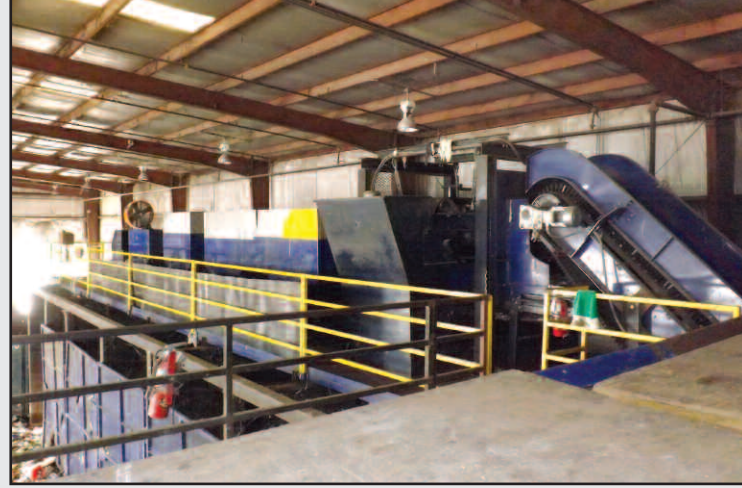
Views of Recycling Line