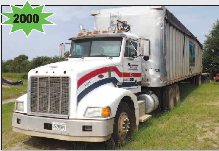
Pete 385 Tractor & Mac Walking Floor Trailer