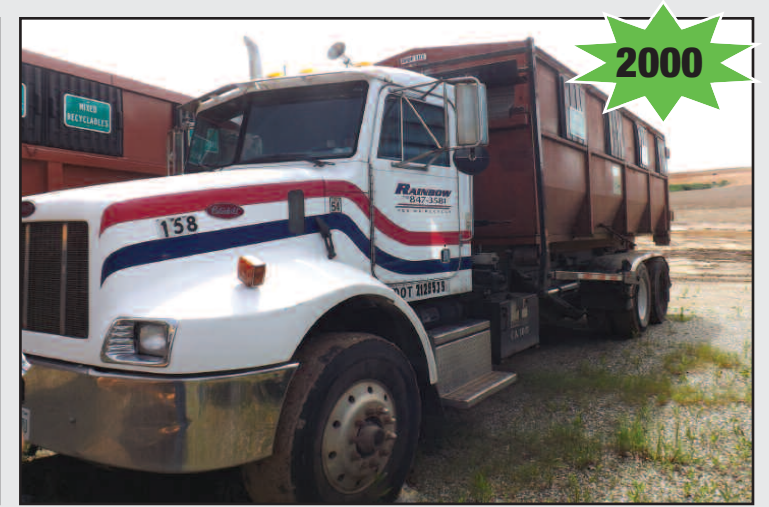
Peterbilt PB330 Rolloff Truck